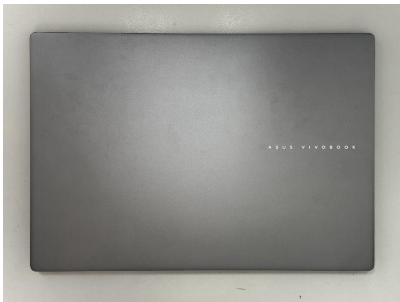
Photograph 5. Front view of EUT