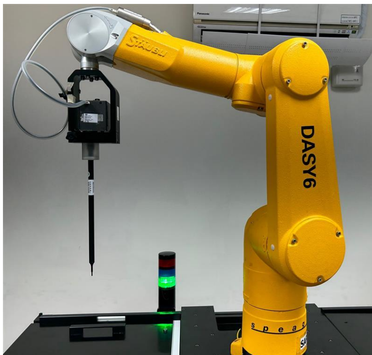
Fig.1 Photograph of the SAR measurement system

Unless otherwise stated the results shown in this test report refer only to the sample(s) tested and such sample(s) are retained for 90 days only. 除非另有說明，此報告結果僅對測試之樣品負責，同時此樣品僅保留90天。本報告未經本公司書面許可，不可部份複製。