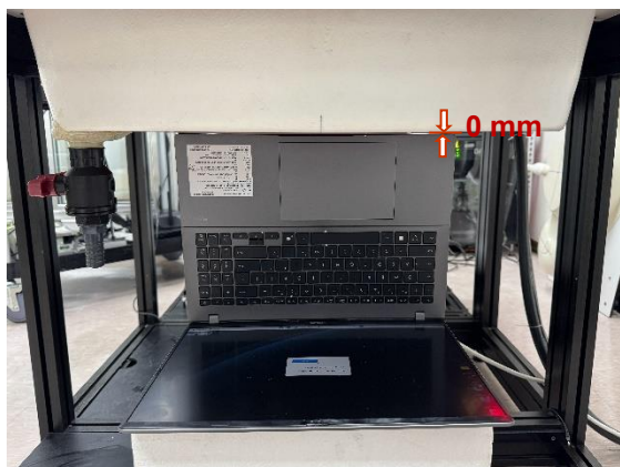
Photograph 3. Body, Front Edge of Laptop, 0mm