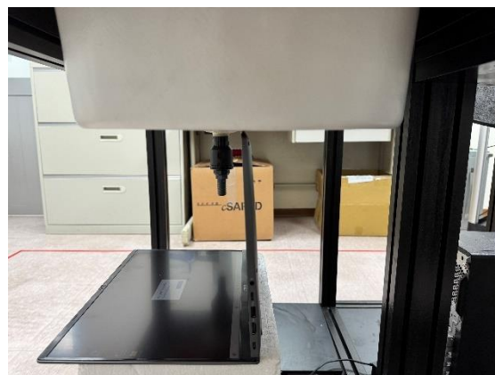
Photograph 4. Body, Front Edge of Laptop, 0mm

Unless otherwise stated the results shown in this test report refer only to the sample(s) tested and such sample(s) are retained for 90 days only. 除非另有說明，此報告結果僅對測試之樣品負責，同時此樣品僅保留90天。本報告未經本公司書面許可，不可部份複製。