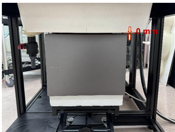
Photograph 1. Body, Bottom of Laptop, 0mm