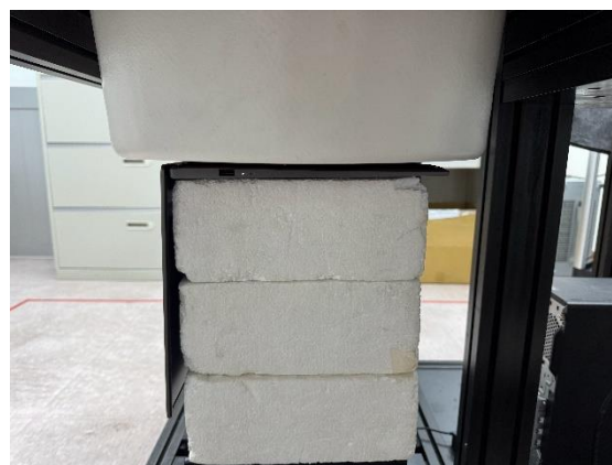
Photograph 2. Body, Bottom of Laptop, 0mm