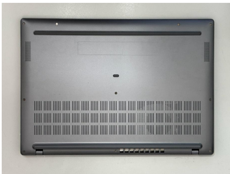
Photograph 6. Back view of EUT

Unless otherwise stated the results shown in this test report refer only to the sample(s) tested and such sample(s) are retained for 90 days only. 除非另有說明，此報告結果僅對測試之樣品負責，同時此樣品僅保留90天。本報告未經本公司書面許可，不可部份複製。