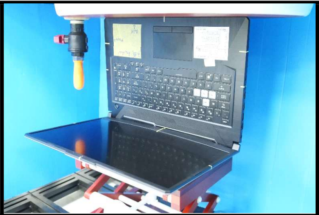
Front Edge of Laptop Tested at 0 mm