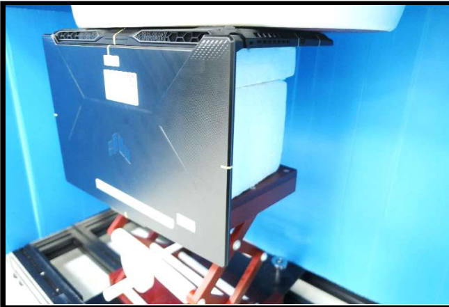
Bottom of Laptop Tested at 0 mm