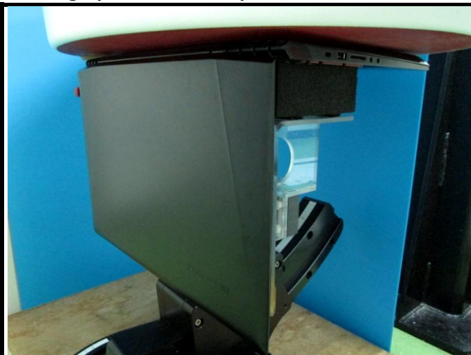
Bottom of EUT with 0 cm Gap