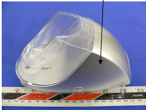
Base of EUT