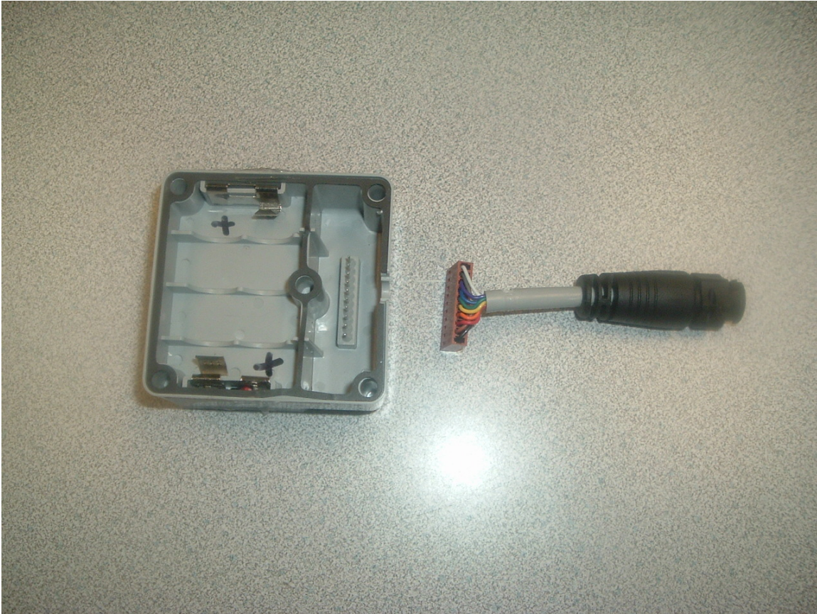
Photo 2 - EUT with battery cover removed and USB pigtail disconnected

TVW-FLEXSI 6322A-FLEXSI 11-0278 January 20, 2012 FLEX SI Numerex