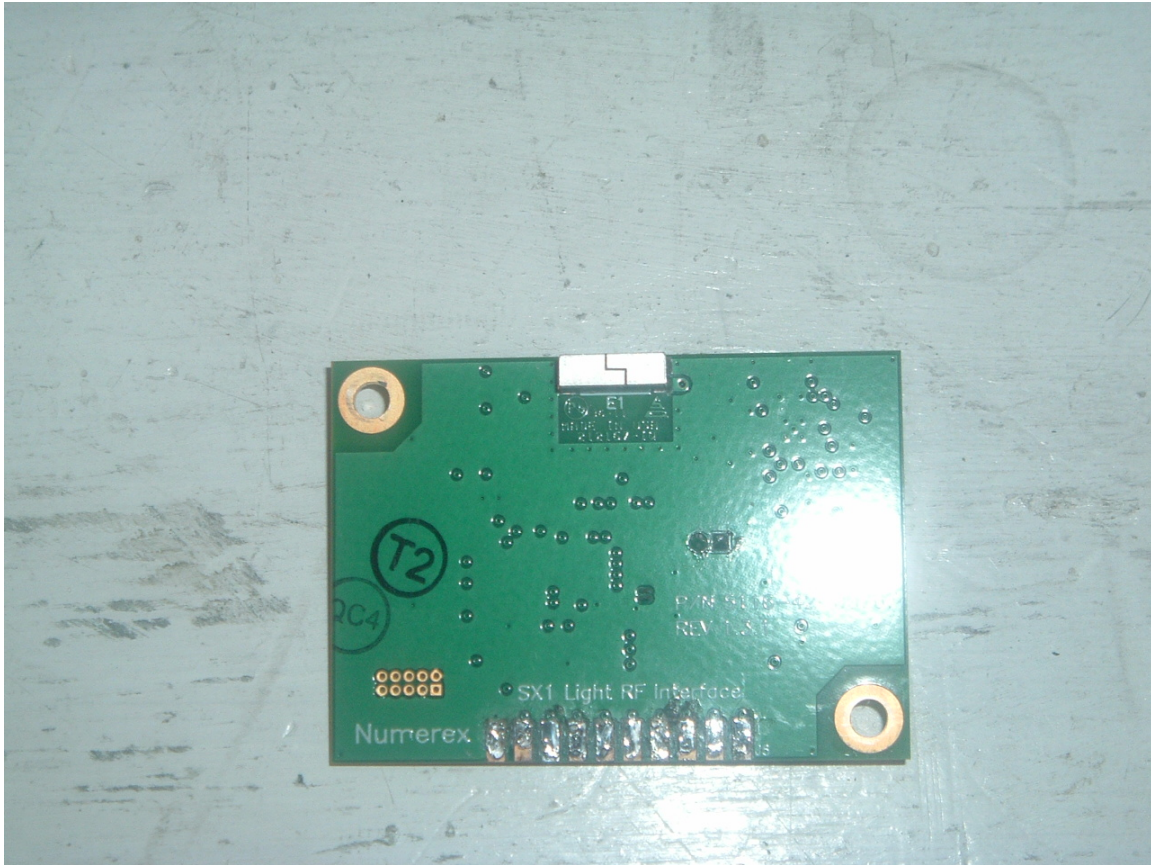
Photo 4 - Solder side of PCB

TVW-FLEXSI 6322A-FLEXSI 11-0278 January 20, 2012 FLEX SI Numerex