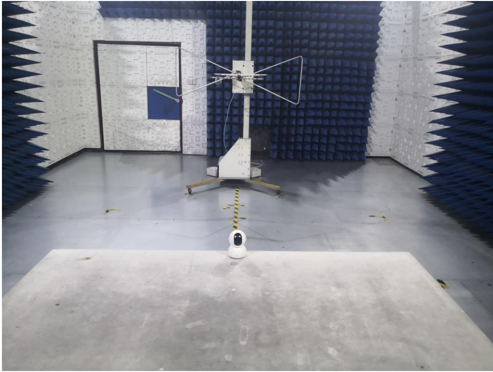
RADIATED EMISSION TEST SETUP ABOVE 1GHz