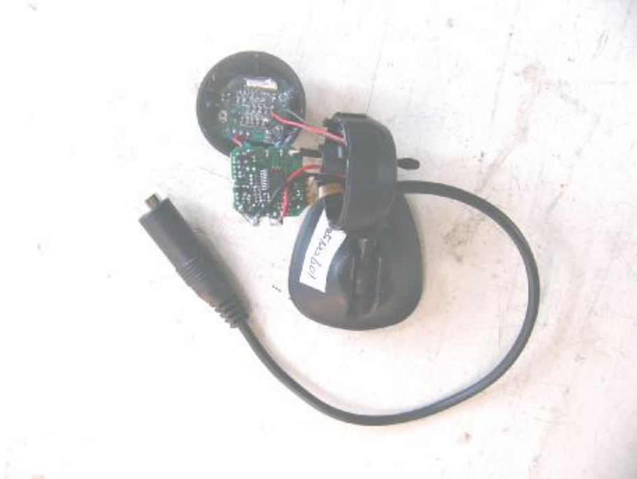
Main & RF board component side