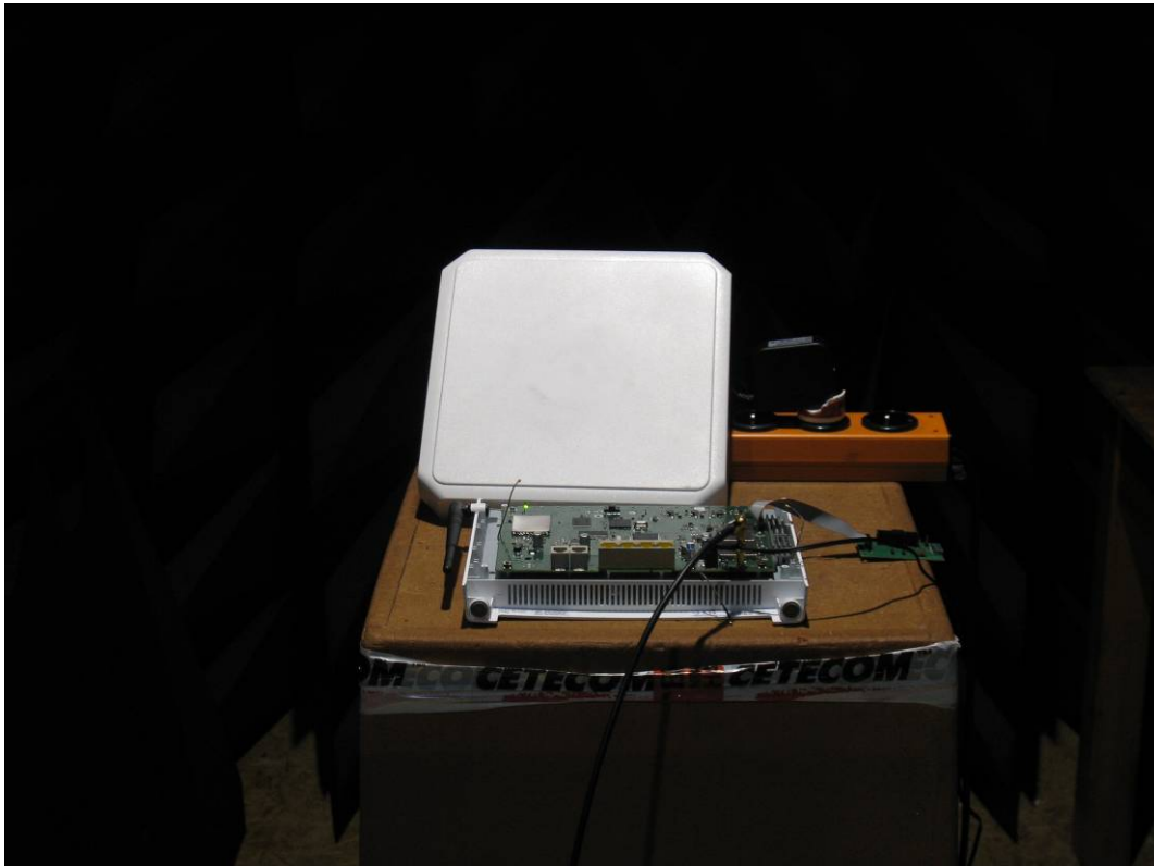
Radiated spurious emissions from 1 - 12 GHz in test chamber