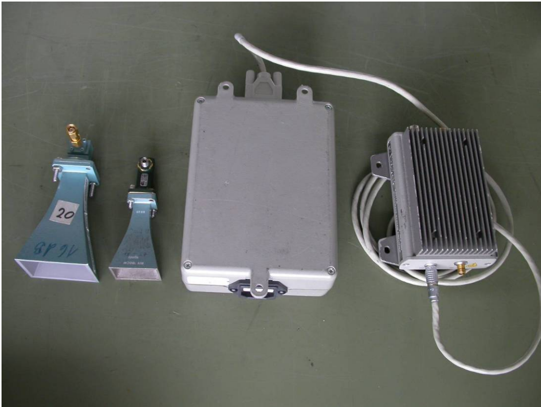
Equipment for radiated spurious emission measurement from 12 GHz to 27 GHz