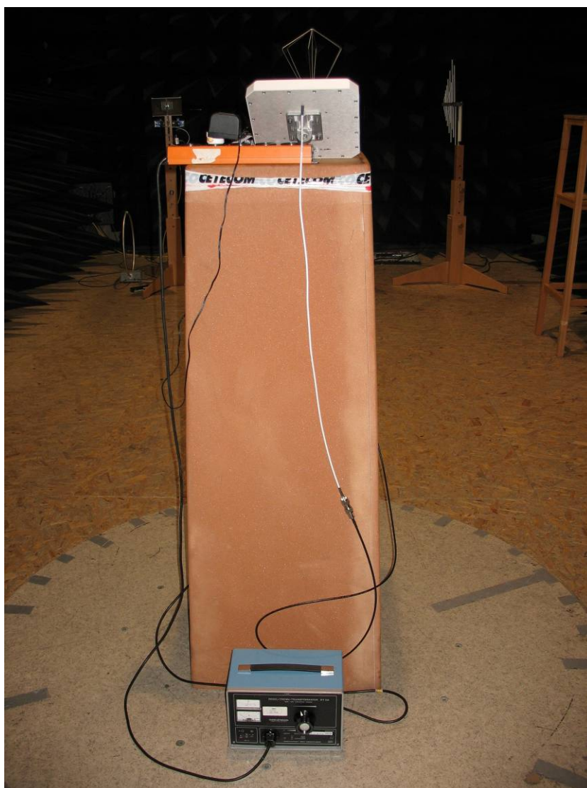
Radiated spurious emissions from 1 - 12 GHz in test chamber