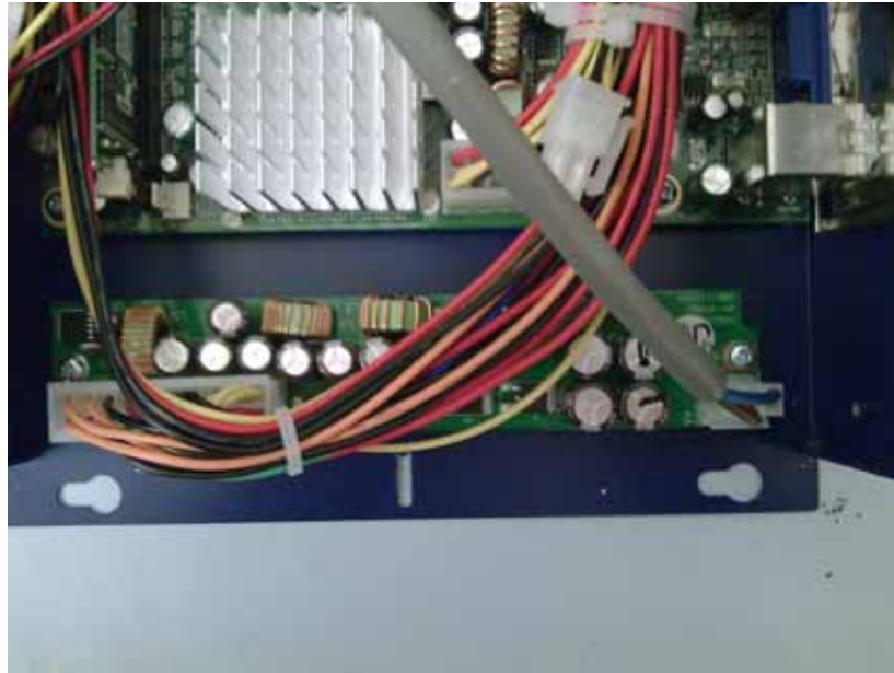
New Power Supply Mounted To Chassis Cables removed