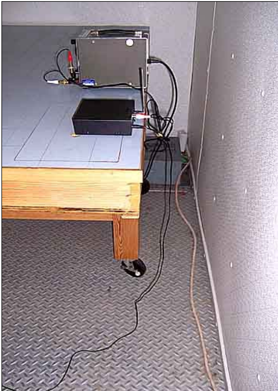
Mains Conducted Emissions - Side View