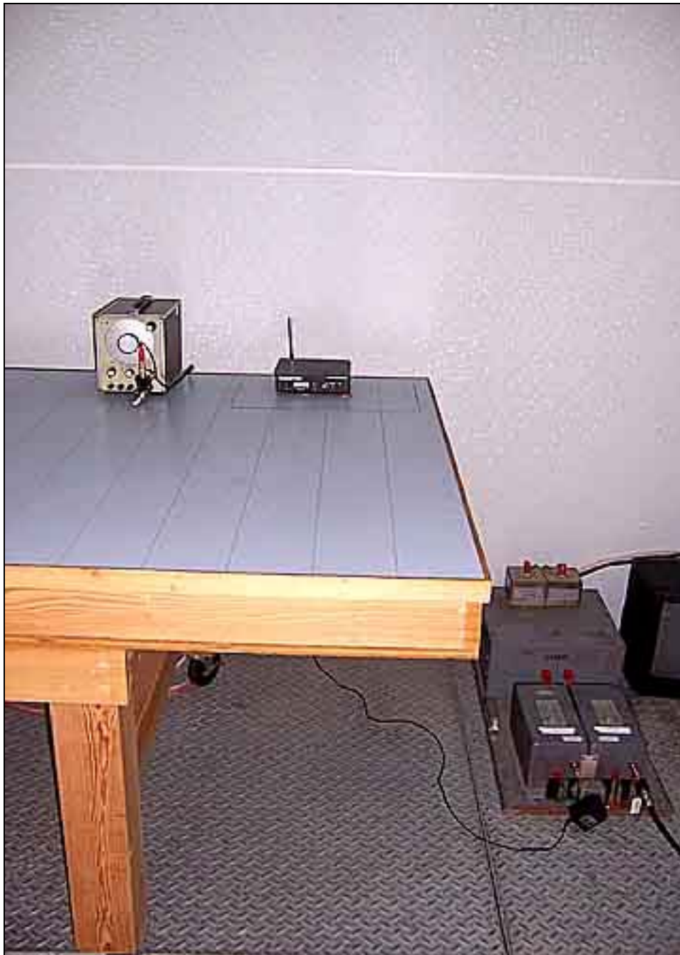
Mains Conducted Emissions - Front View