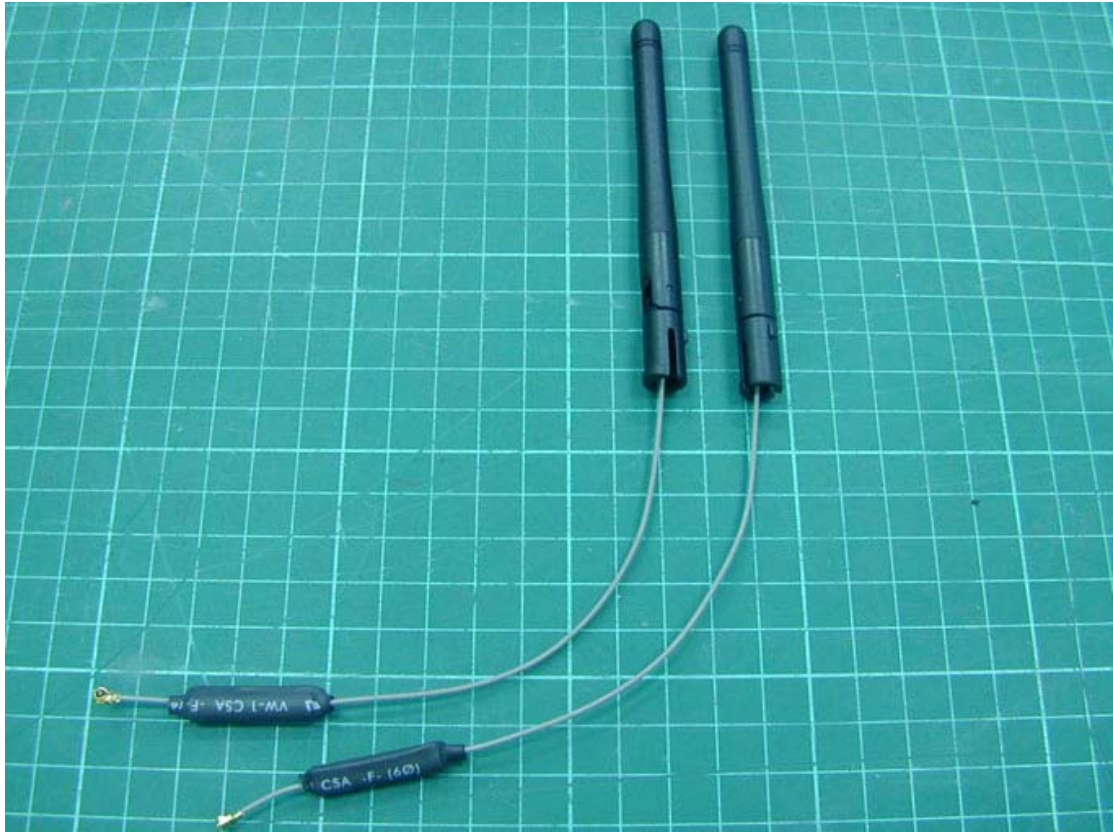
Antenna: Set 2