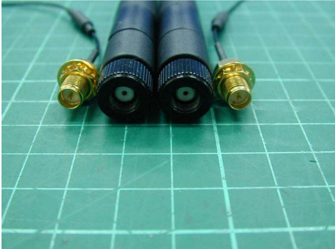
Antenna: Set 4