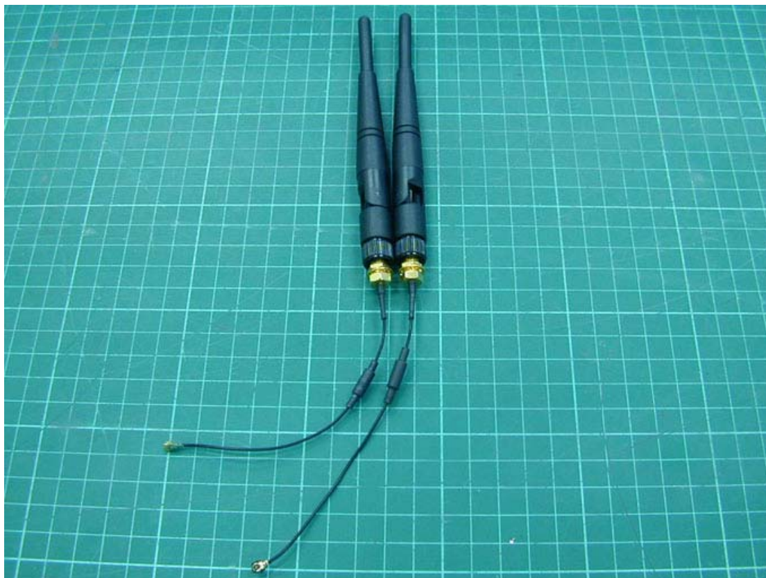
Antenna: Set 4