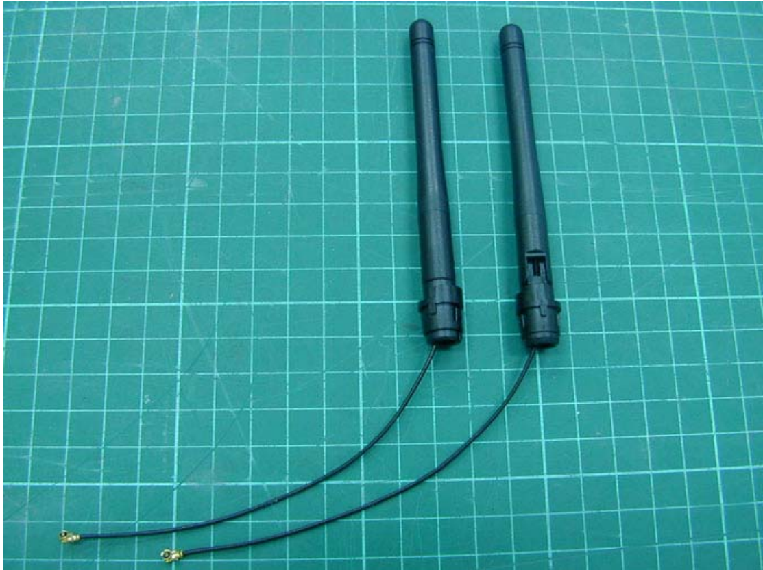
Antenna: Set 1