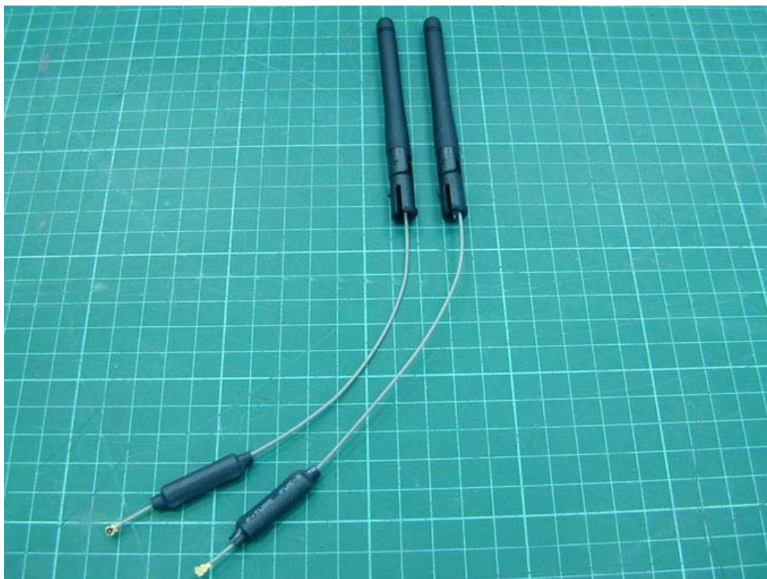
Antenna: Set 3