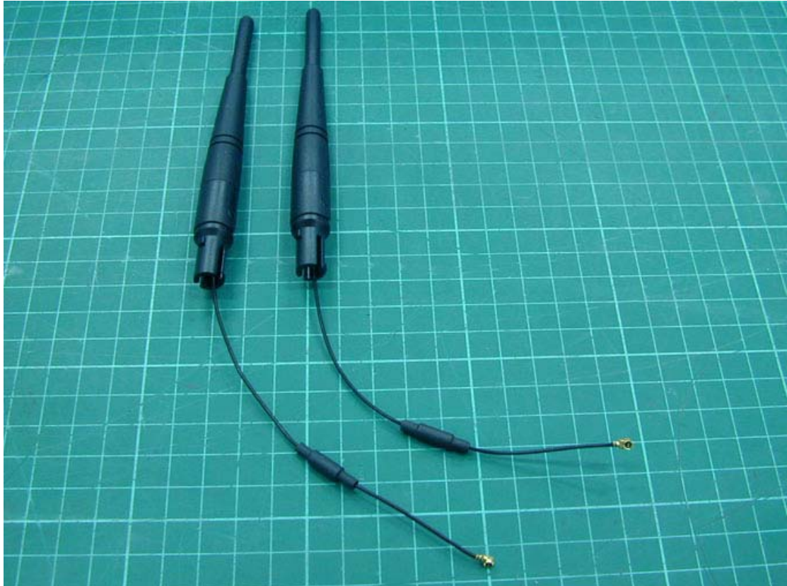
Antenna: Set 5