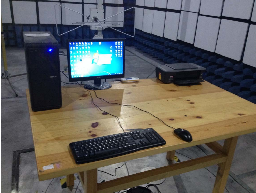
30MHz-1GHz (Charge test mode) Front