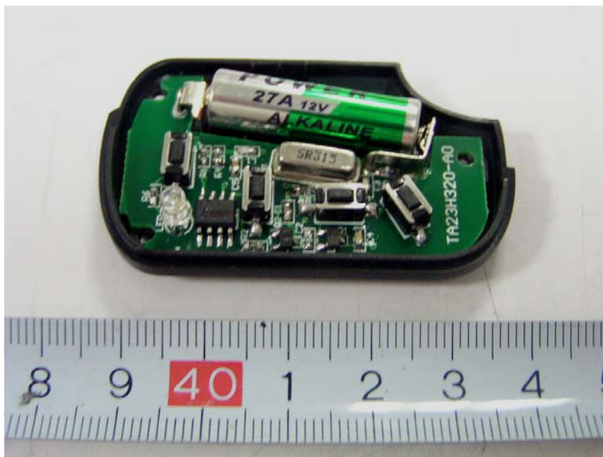
EUT-Inside View (3)