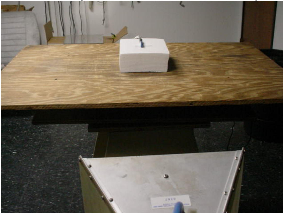
Figure 3 - Power, Spurious & Other > 1 GHz Measurements