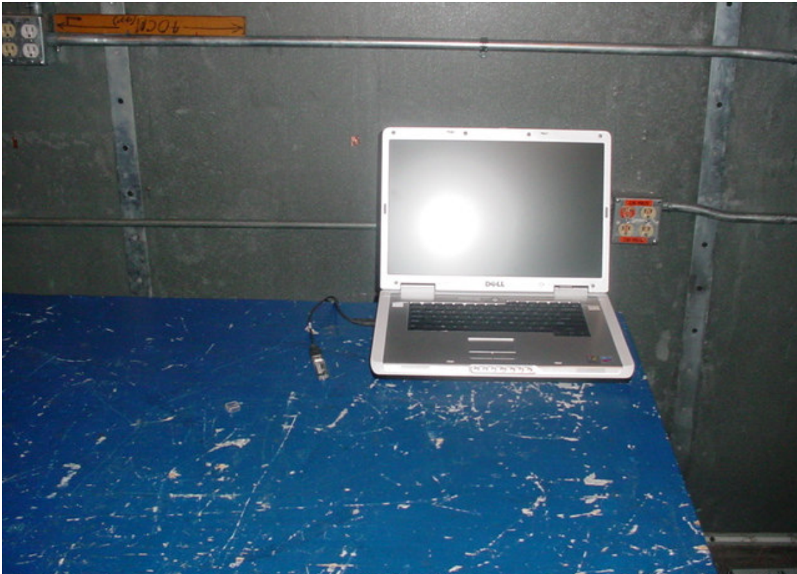
Figure 1 - Mains Conducted Emission