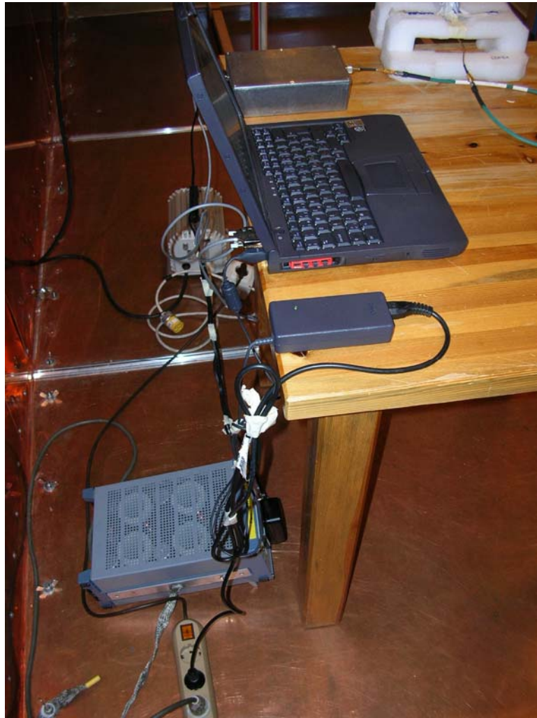
Conducted disturbance voltage at AC terminal