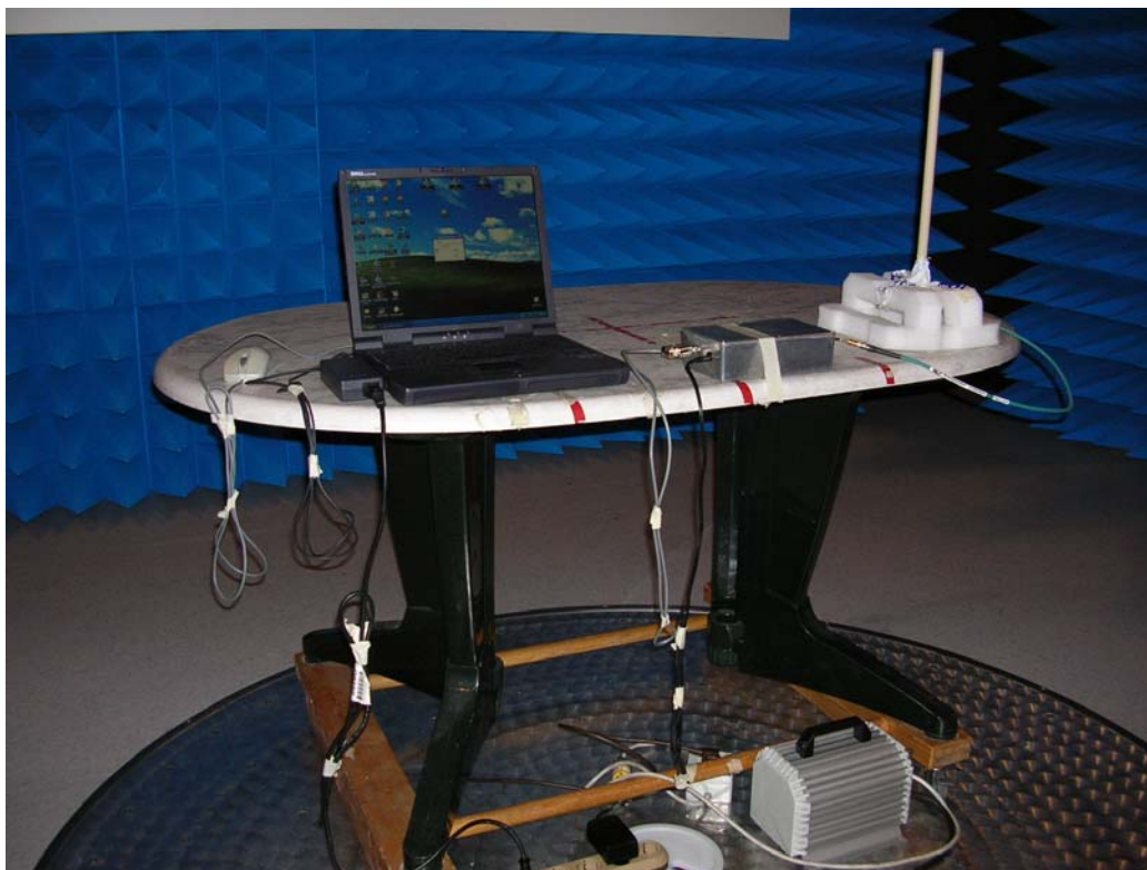
Radiated spurious emission 30-1000 MHz