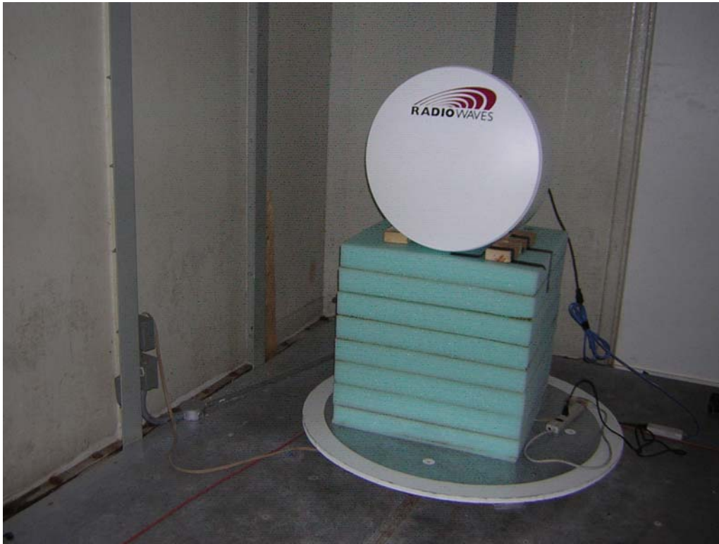
Radiated EMI (with Radio Wave antenna)