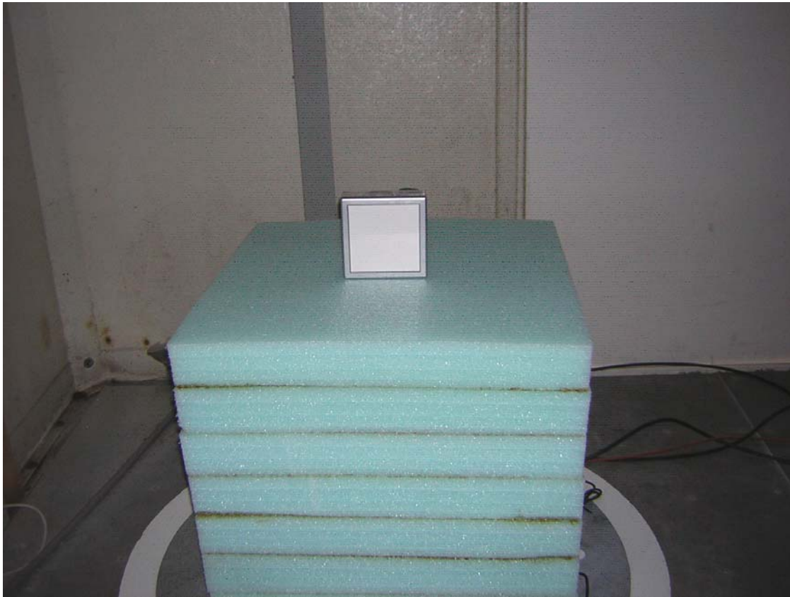
Radiated EMI (with SL60-100-57/64-E-O)