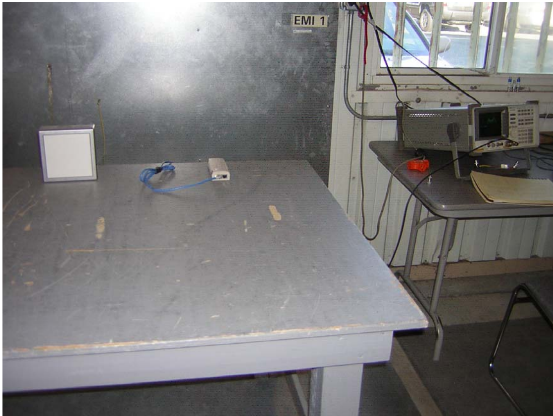
AC conducted emissions