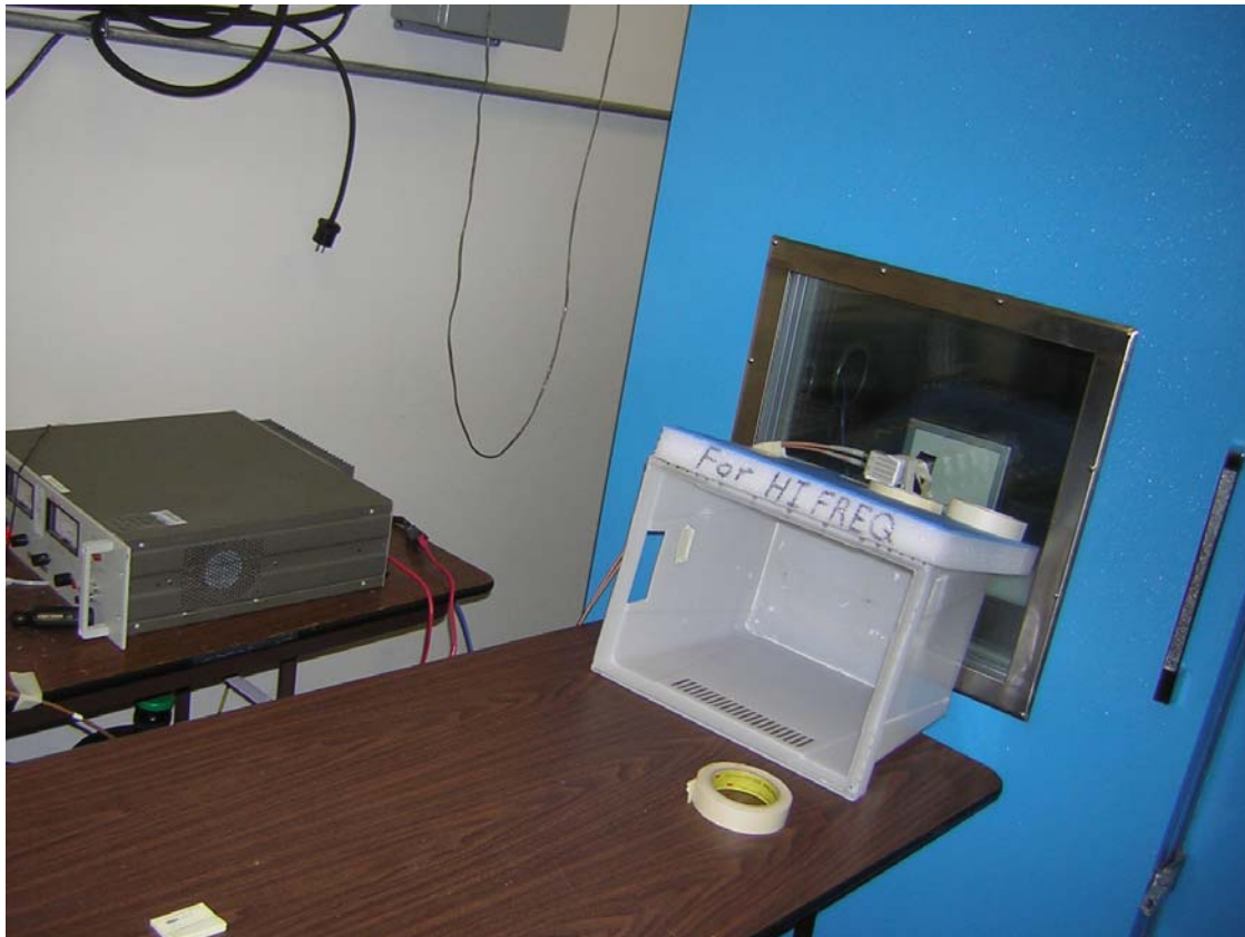
Voltage variations and frequency stability under extreme temperatures