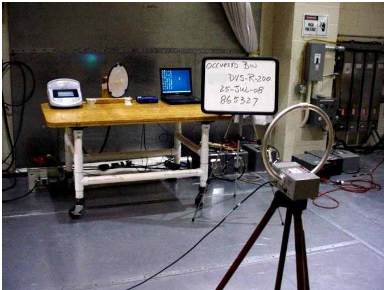
Figure 3 Test Setup for Occupied Bandwidth