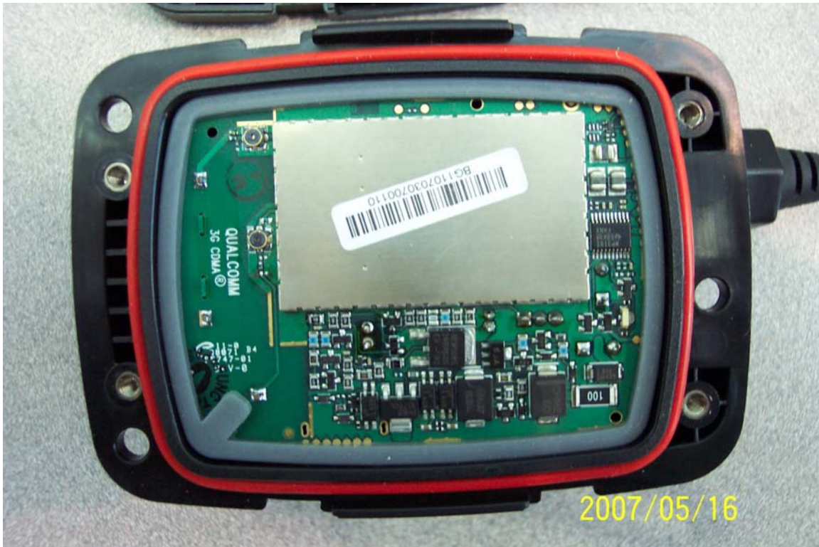
PCB Top View Shield Removed