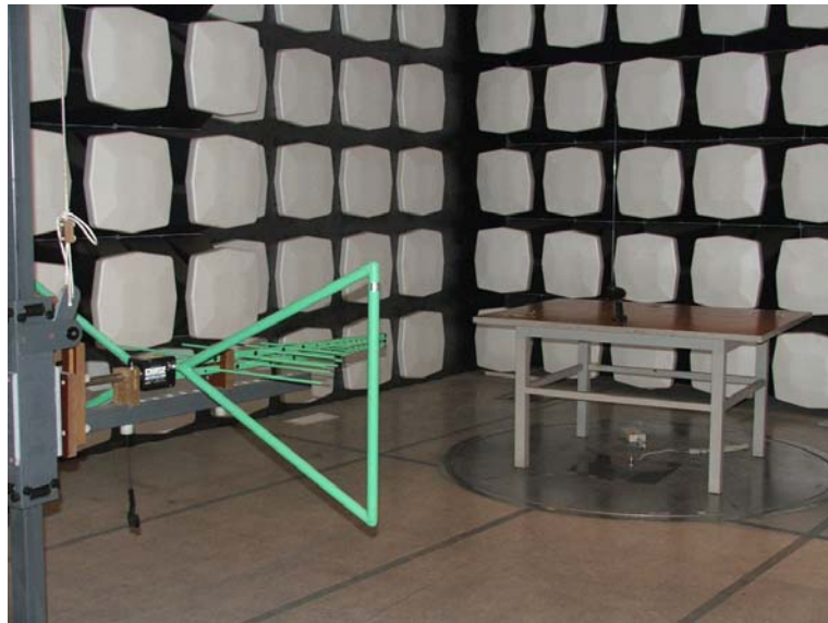
RADIATED EMISSION ((Transmitter) H