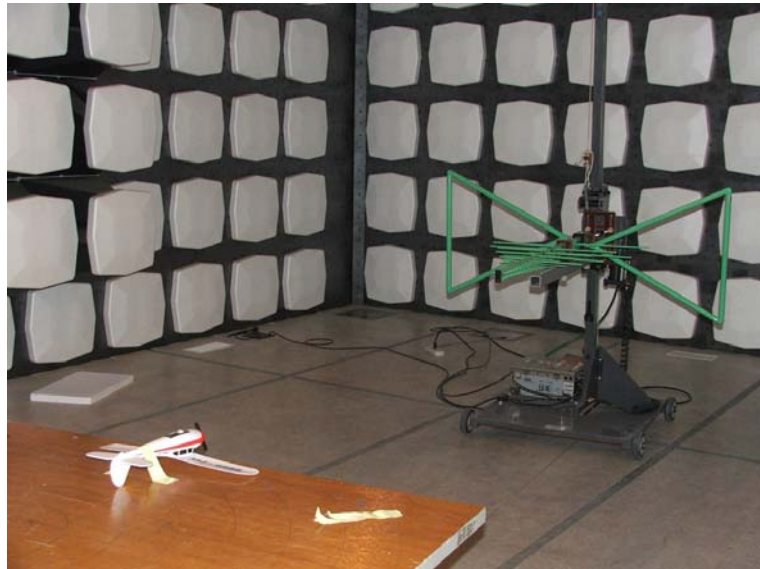
RADIATED EMISSION (Receiver) H