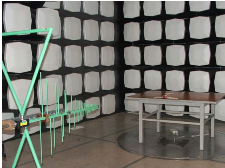
RADIATED EMISSION (Receiver) V