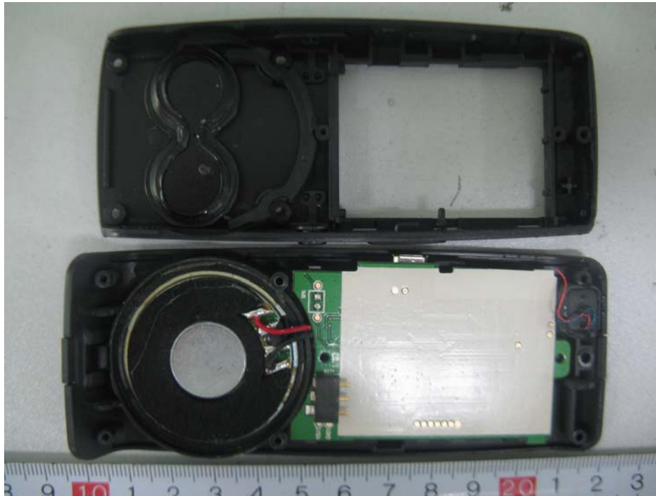
EUT –Main Board Top Components View