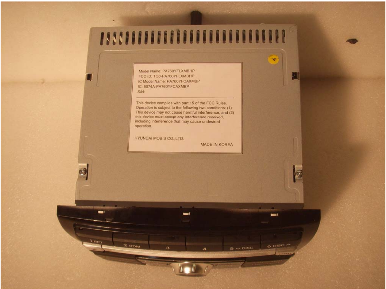
Figure 1.2 LABEL LOCATION

The label shown shall be permanently affixed at a conspicuous location on the device and be readily visible to the user at the time purchase. (Labeling requirements per 2.925)