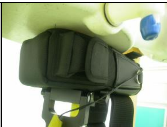
BOTTOM MODEL SC700