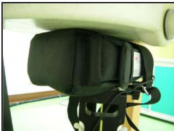
FRONT MODEL SC700