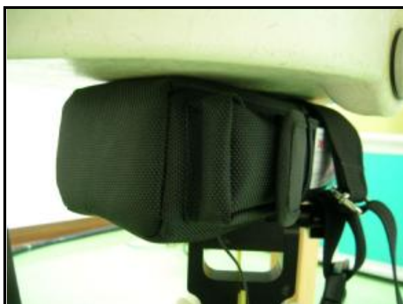
FRONT MODEL SC720