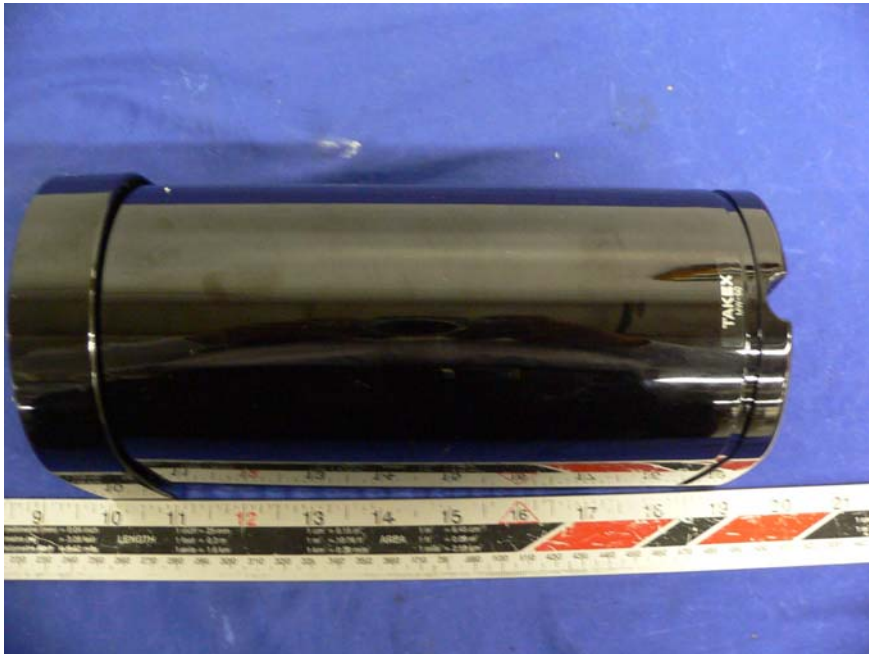
Receiver – Rear View