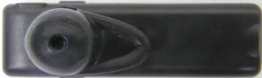
Side View of EUT - 3