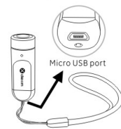
ClickStik Bluetooth Remote Control