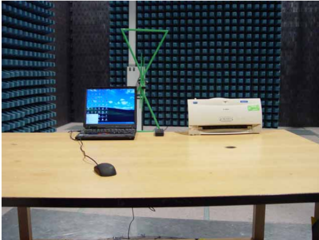
Photo 4 Radiated Emission Test