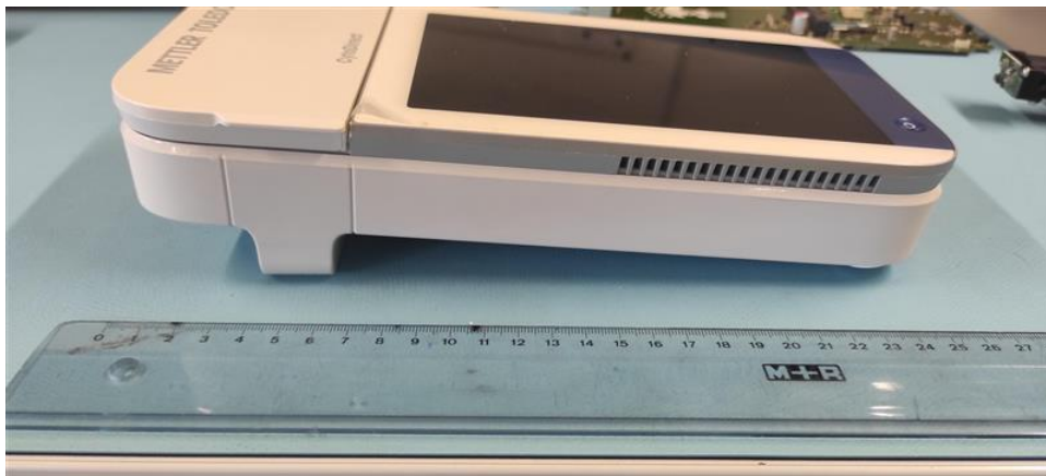
CytoDirect – side left