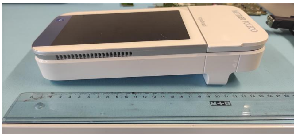
CytoDirect side right