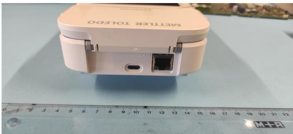
CytoDirect side top