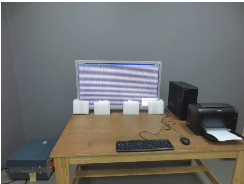
Figure 1. Conducted Emission Test Setup