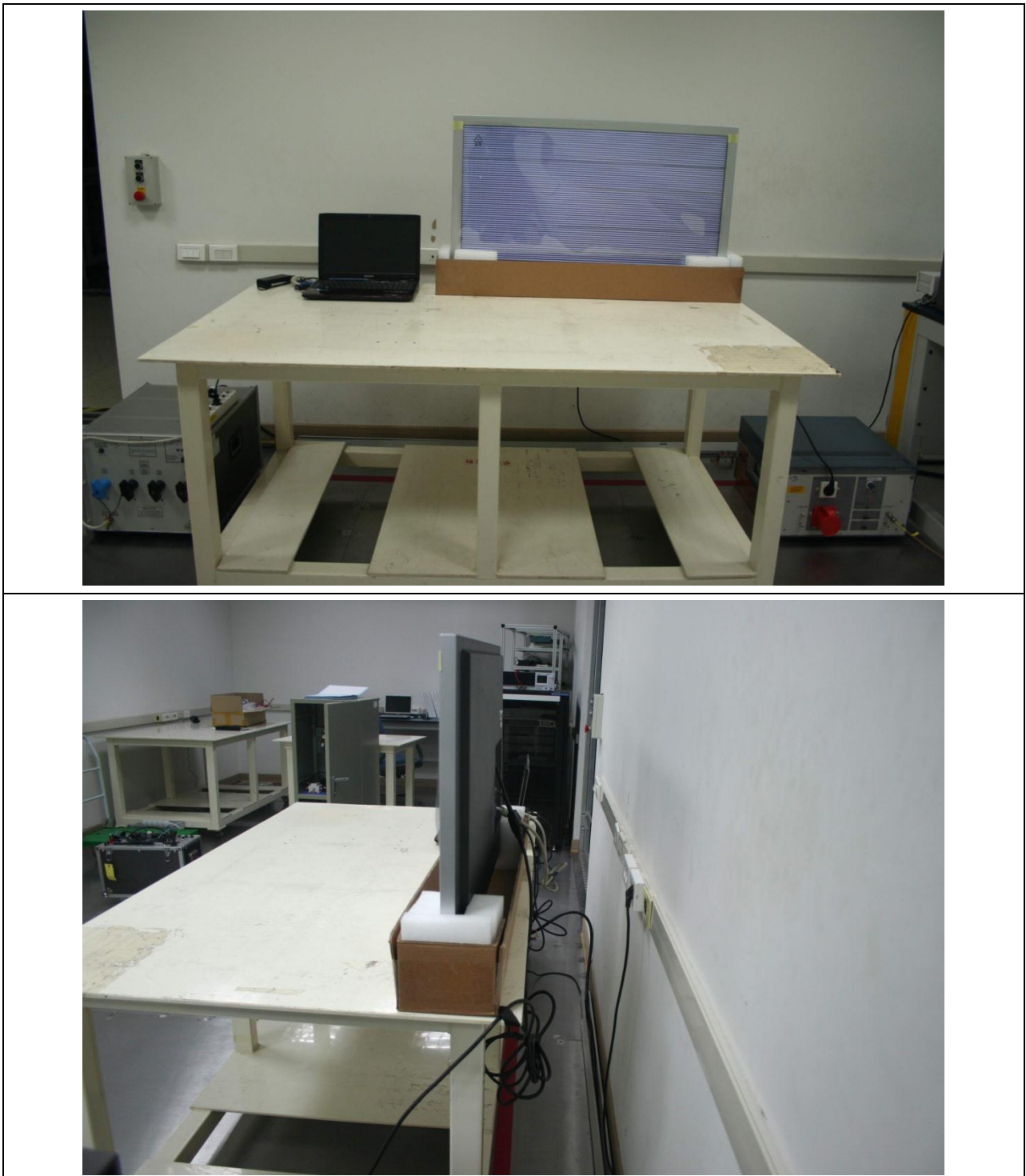
Figure 1. Conducted Emission Test Setup for VGA Mode: