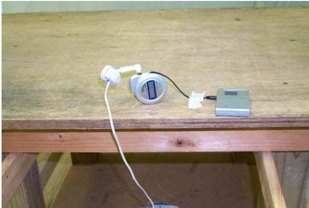
Figure 3.5 Radiated Test Setup, position 2-Y(DC Power)