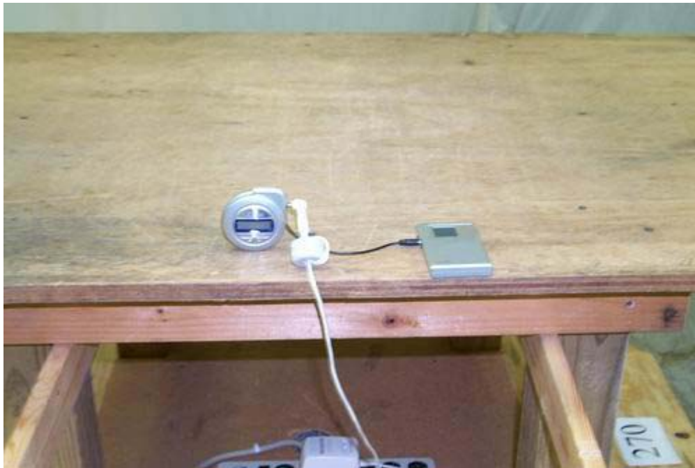
Figure 3.4 Radiated Test Setup, position 1-X (DC Power)