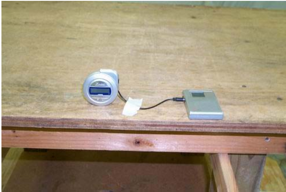
Figure 3.1 Radiated Test Setup, position 1-X