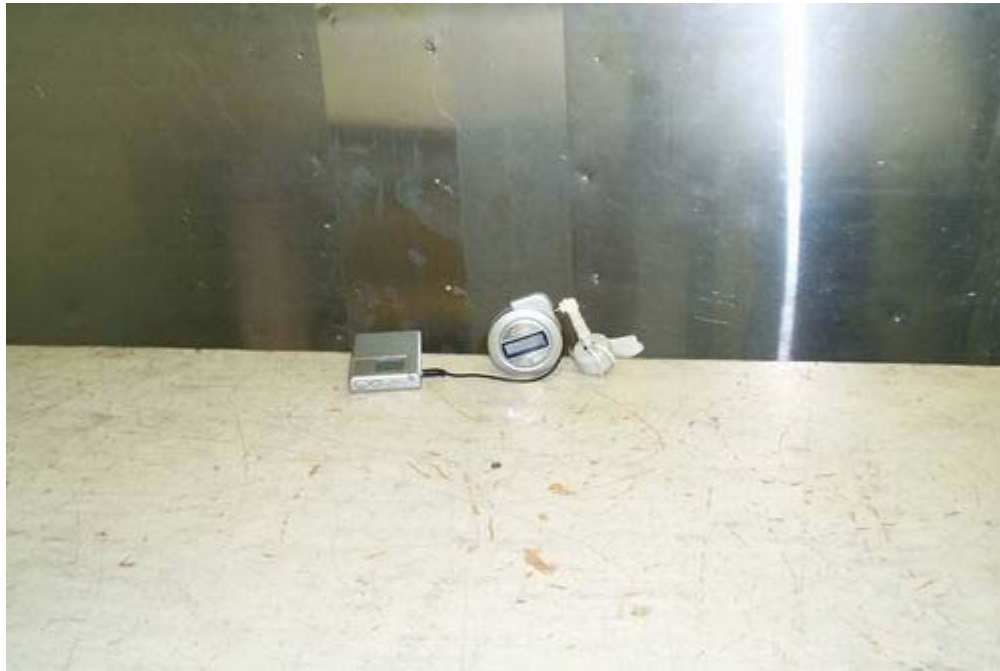
Figure 3.7 Conducted Setup- Front