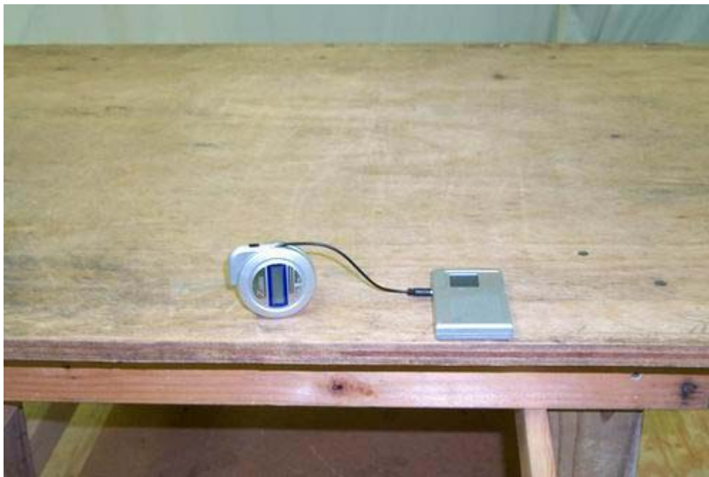
Figure 3.2 Radiated Test Setup, position 2-Y