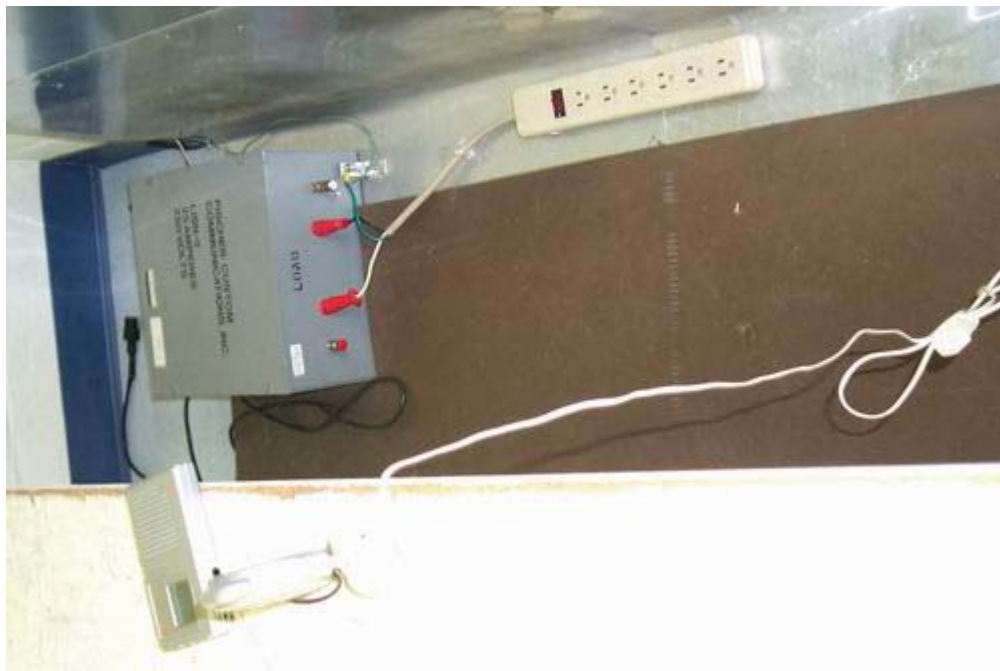
Figure 3.8 Conducted Setup- Rear