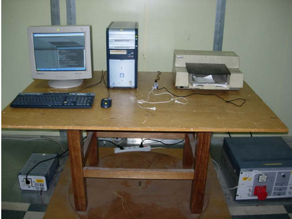
Conducted emission ( Rear )