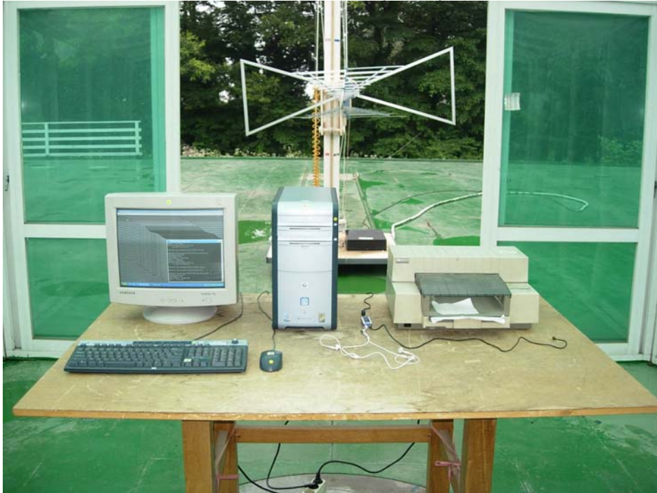
Radiated Emission ( Rear )