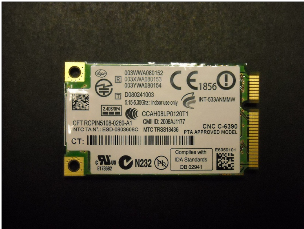
Figure 2: PCB - Back