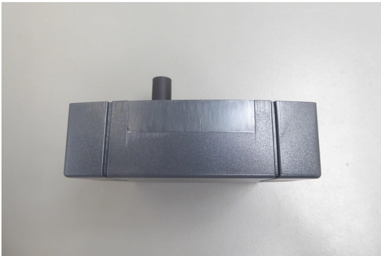
Figure 8 - Bottom View