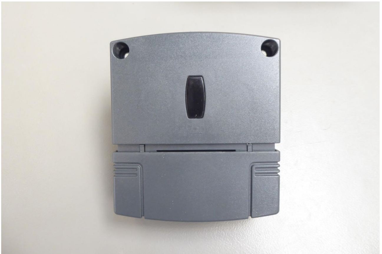
Figure 1 - Front View