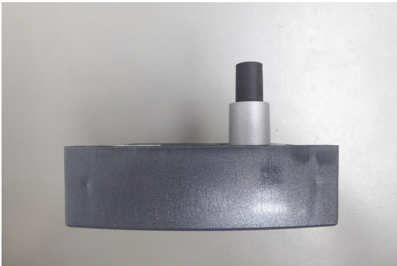
Figure 4 - Top View 1