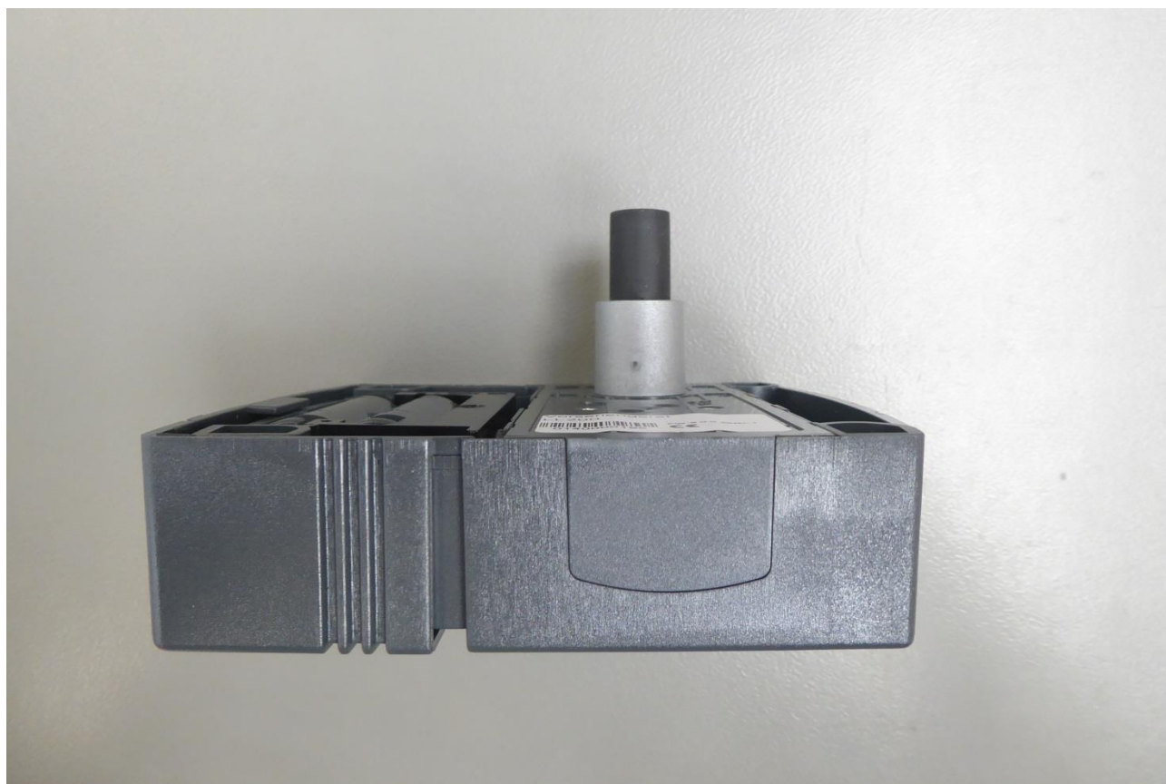
Figure 6 - Side View A