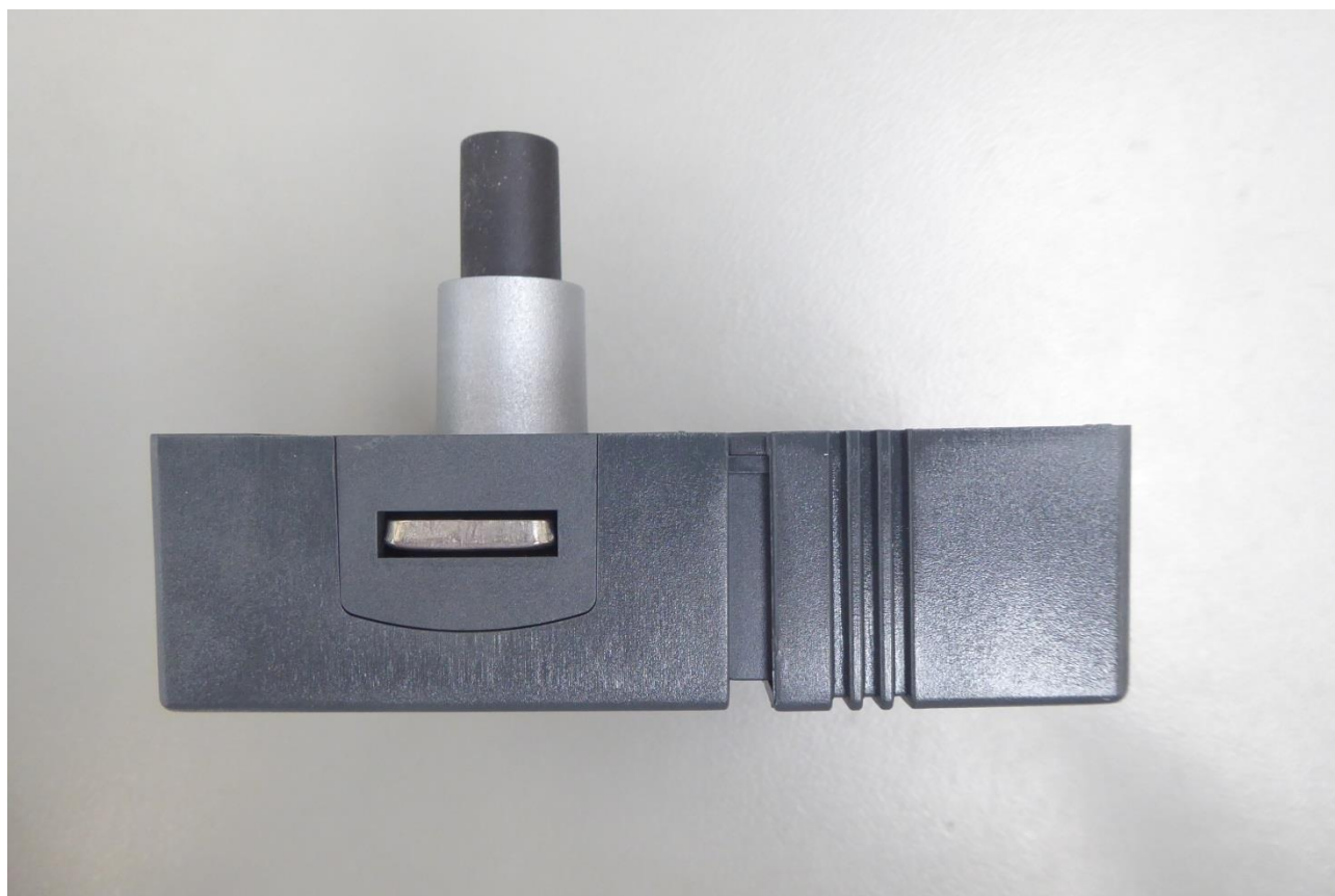
Figure 7 - Side View B