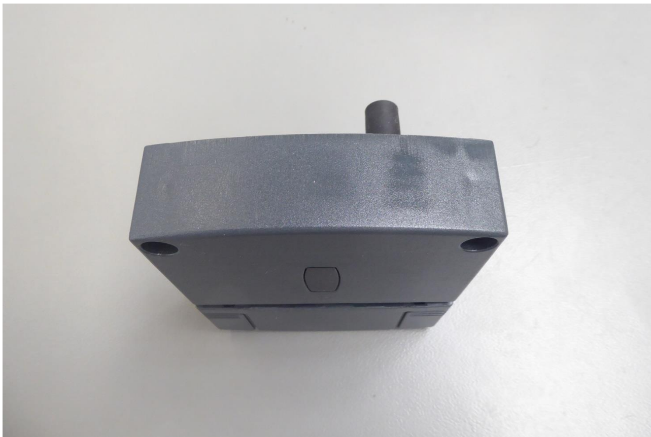
Figure 5 - Top View 2