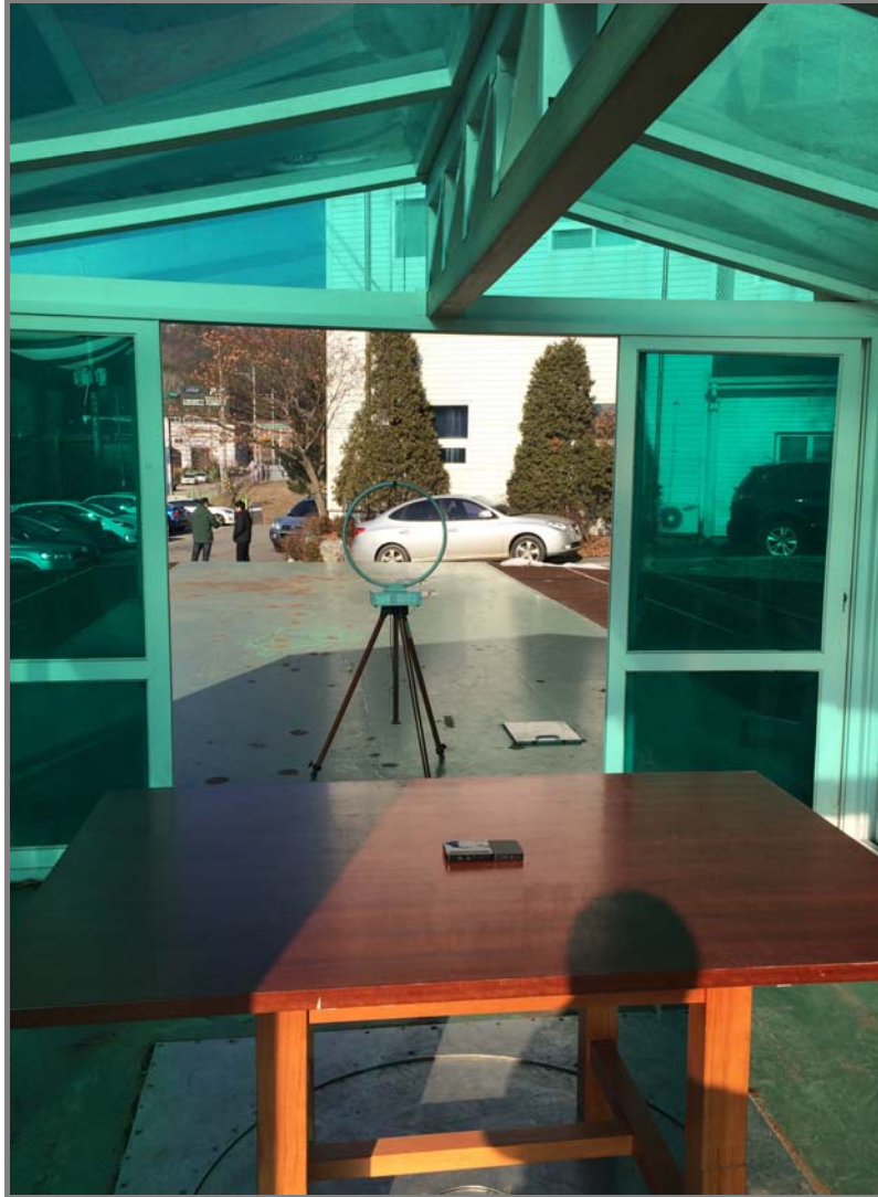
Photo of radiated spurious emission at below 30 MHz