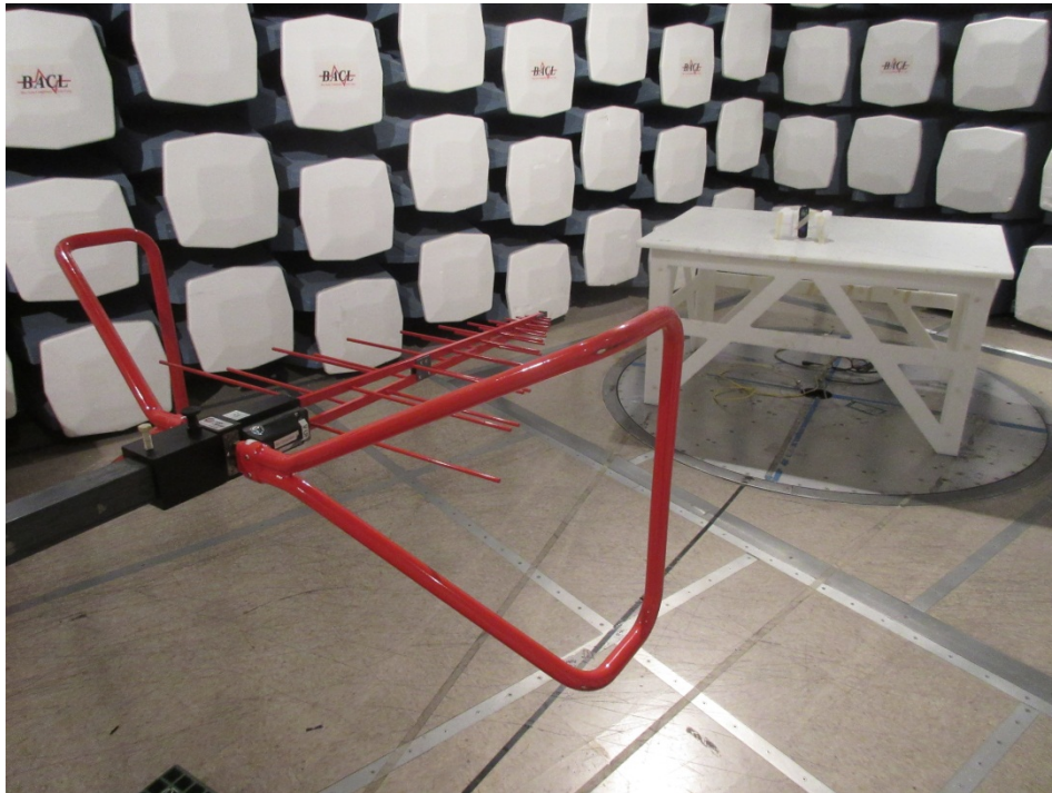
Radiated Emission below 1 GHz Rear View