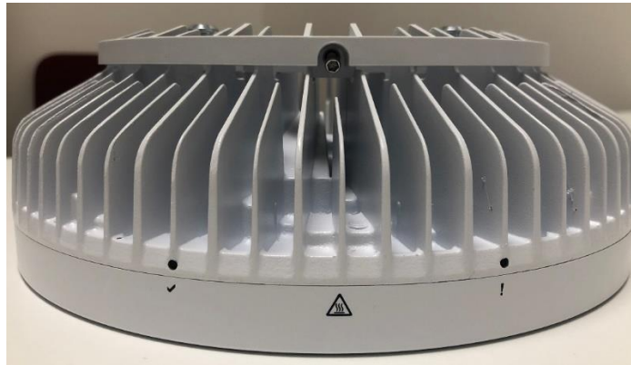
Figure 3: Dot 44Kr B48 Side View