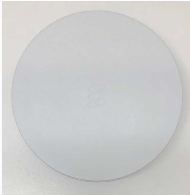
Figure 1: Dot 44Kr B48 Top (Radome) View