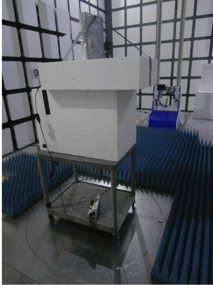
Radiated Emissions 1 GHz to 8 GHz