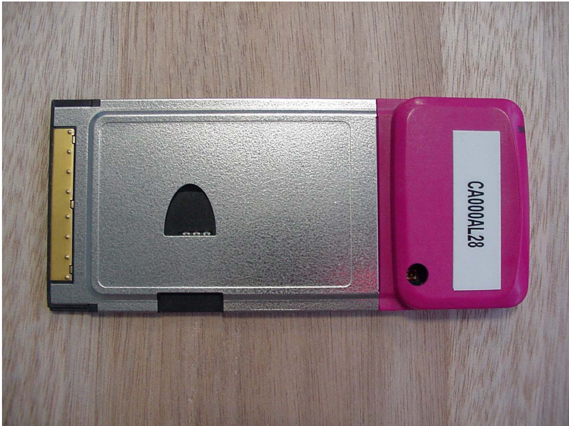
Photo 1: EUT (front side, with temporary antenna connector at top side which was used for testing)