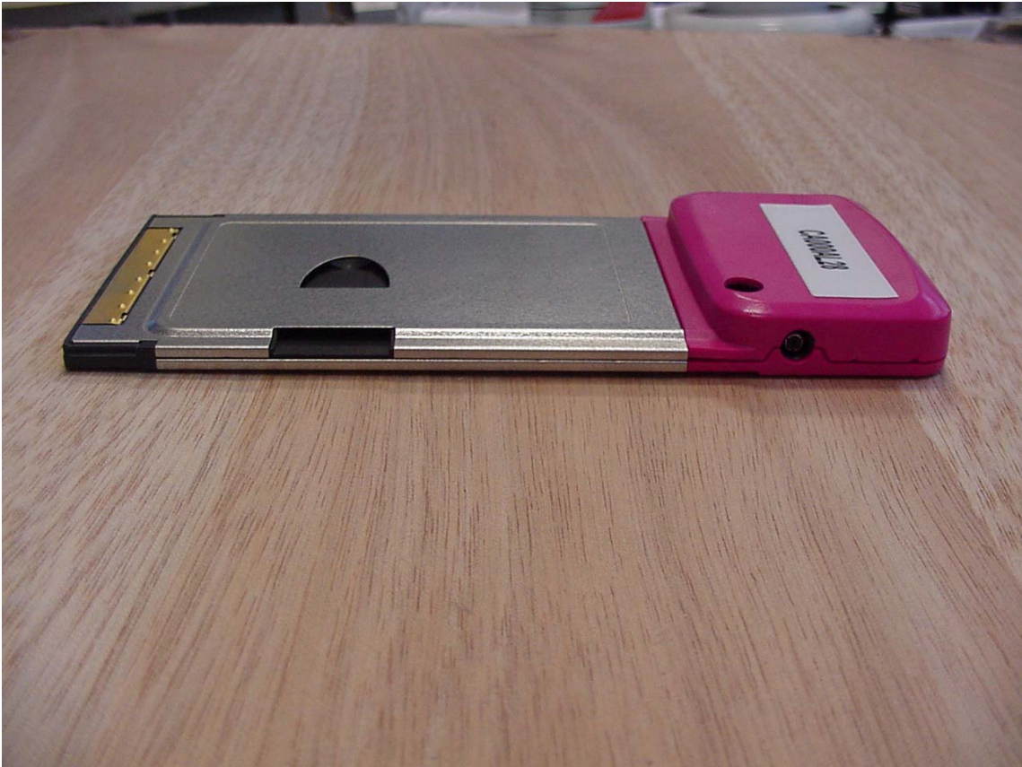
Photo 3: EUT (left side with SIM card holder and temporary antenna connector which was not used for testing)