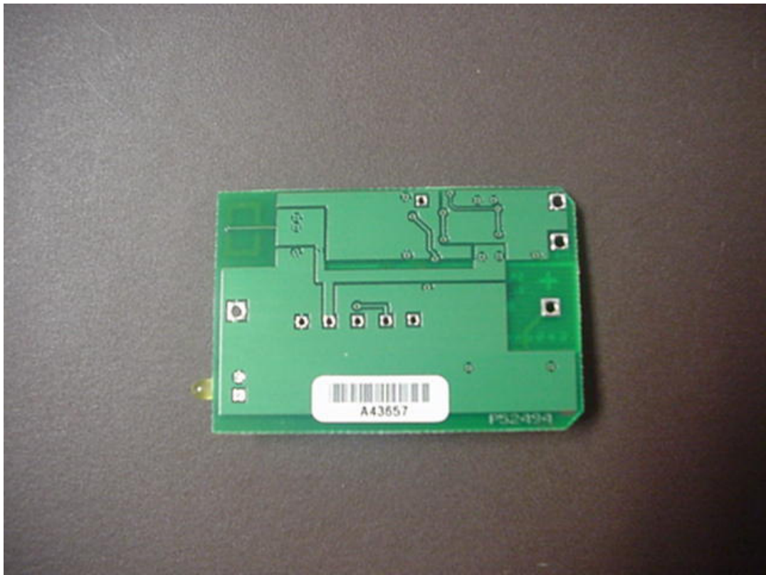
EUT PCB Bottom