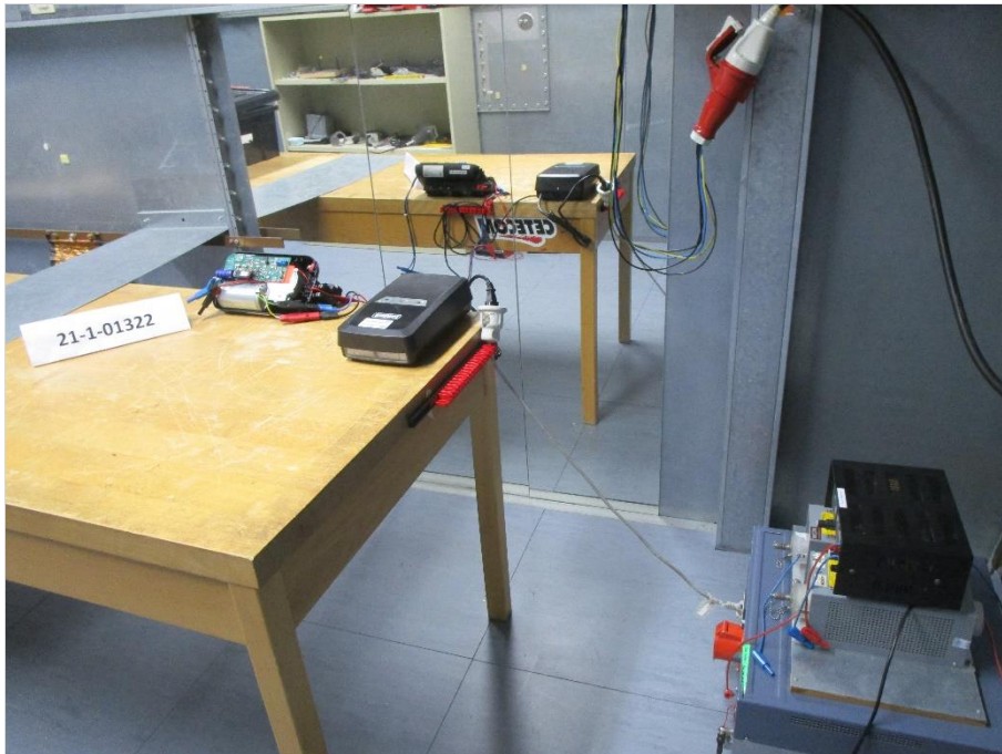
Photograph 1: EUT test setup Conducted emissions on DC-Power lines