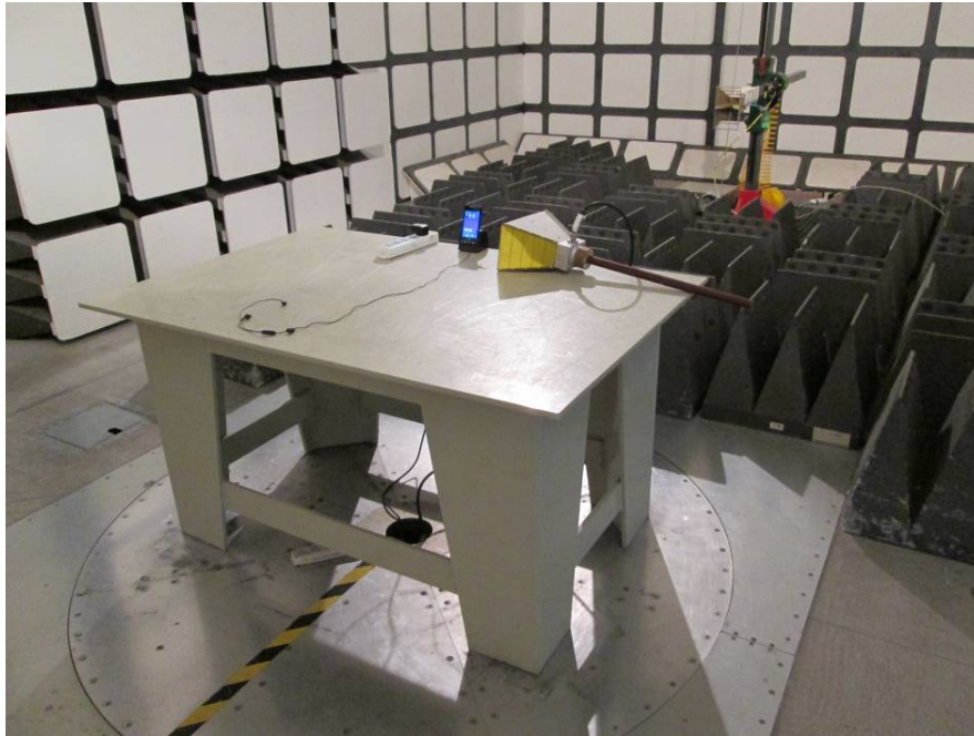
Radiated Emissions – Rear View (Above 1 GHz)