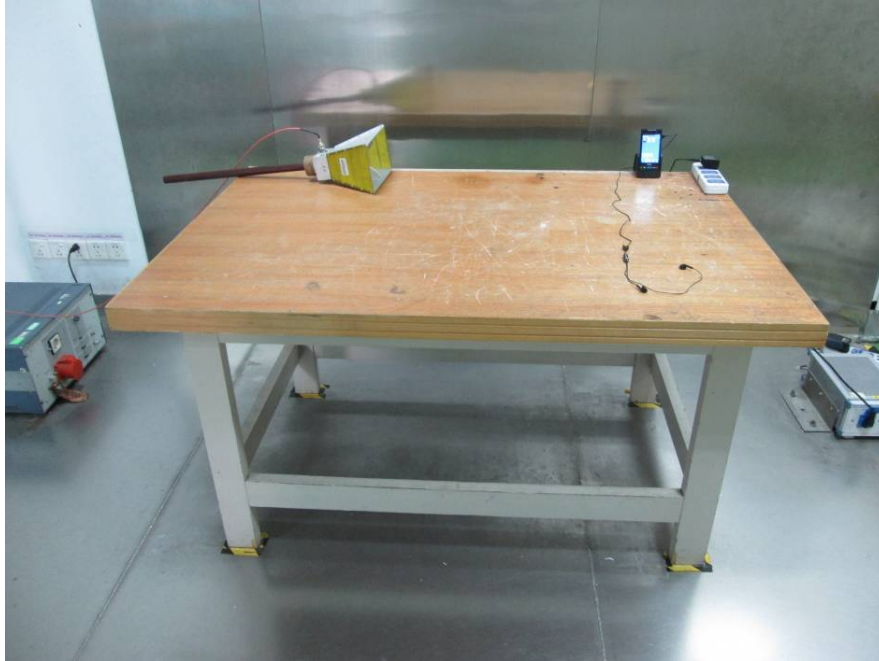
Conducted Emissions – Side View