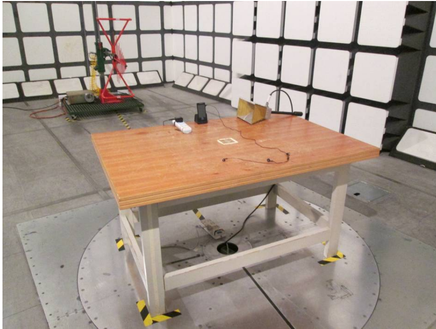
Radiated Emissions – Rear View (Below 1 GHz)