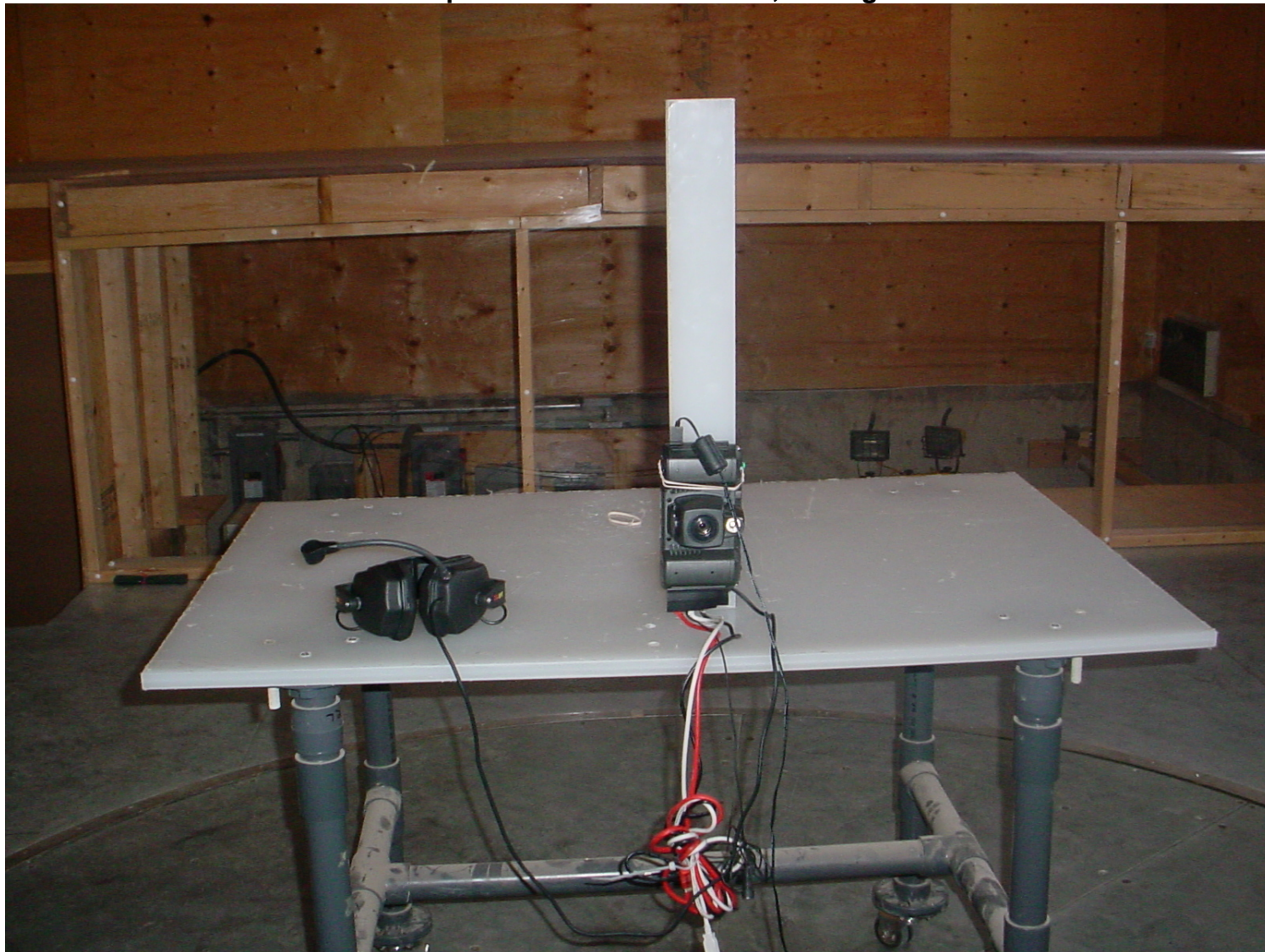
Photo #5: Test Setup for Radiated Emissions, Orthogonal Position #3