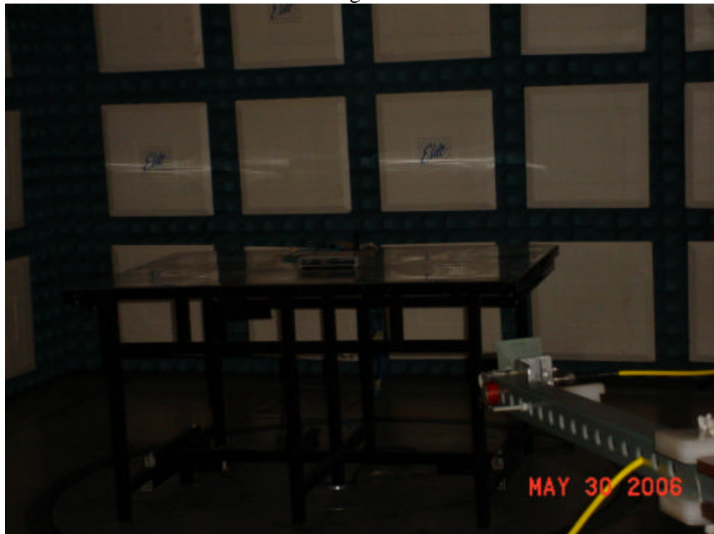
Test Setup for Radiated Emissions – Horizontal Polarization