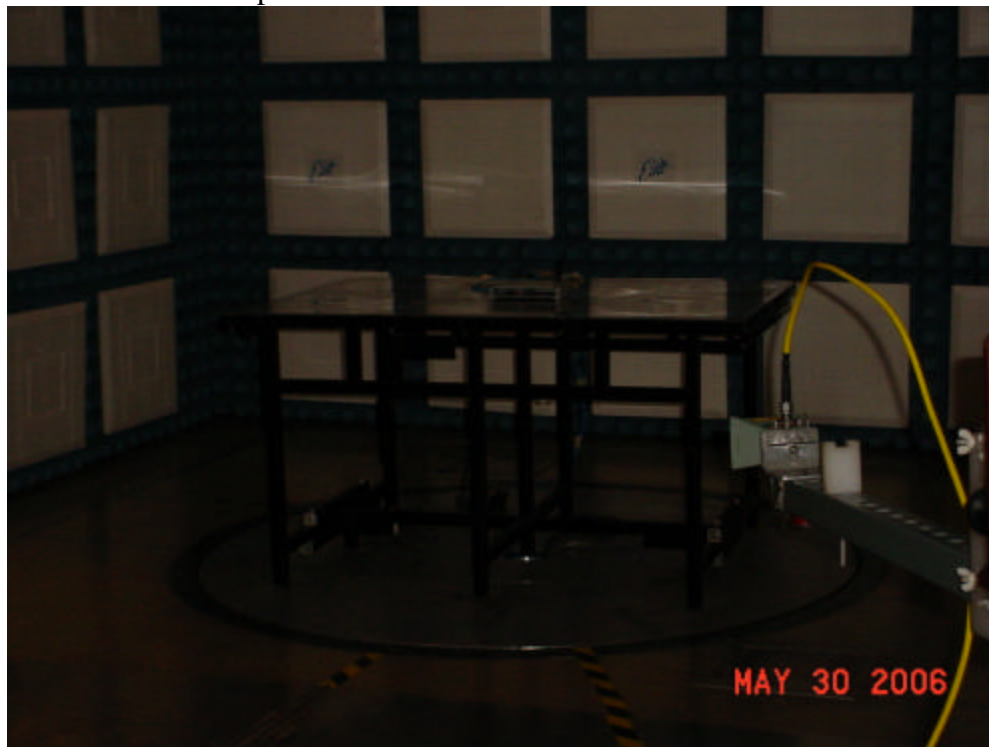
Test Setup for Radiated Emissions – Vertical Polarization