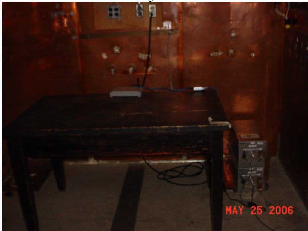
Test Setup for Power Line Conducted Emissions - PoE