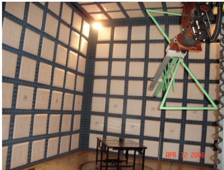
Radiated Emissions – Vertical Polarization