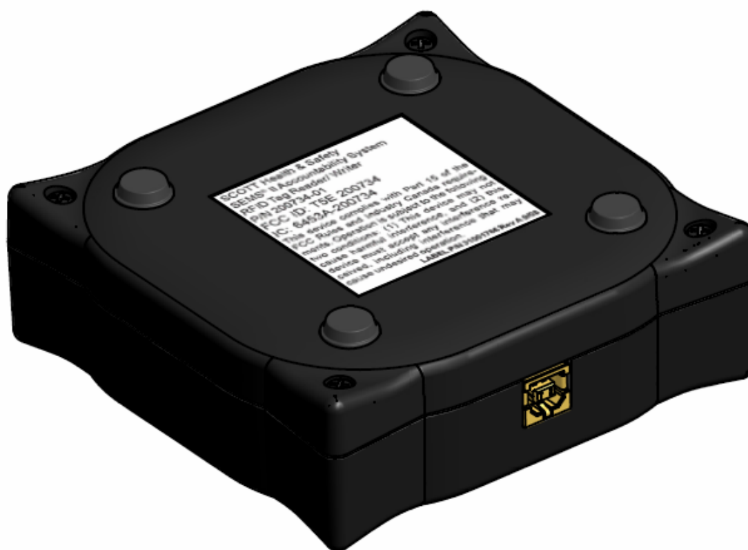
Figure 2: Label Location