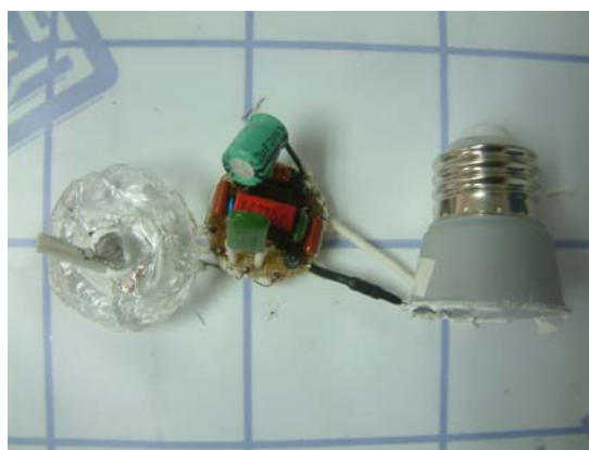
Internal photo view -2