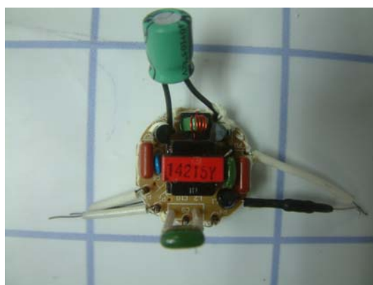
PCB Layout -1

Copyright of this report is owned by Centre of Testing Service and may not be reproduced other than in full except with the written approval of the issuing Company.