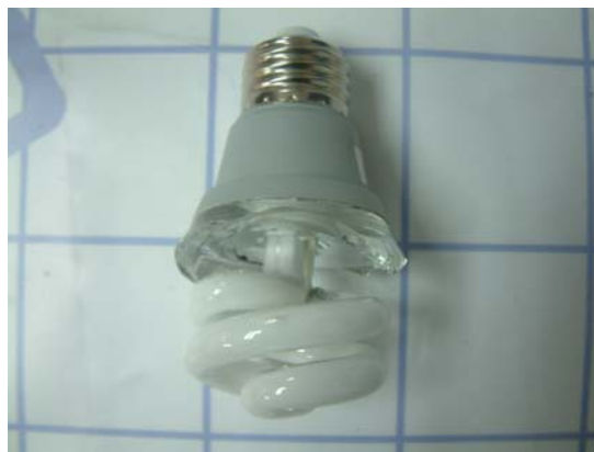
Internal photo view -1