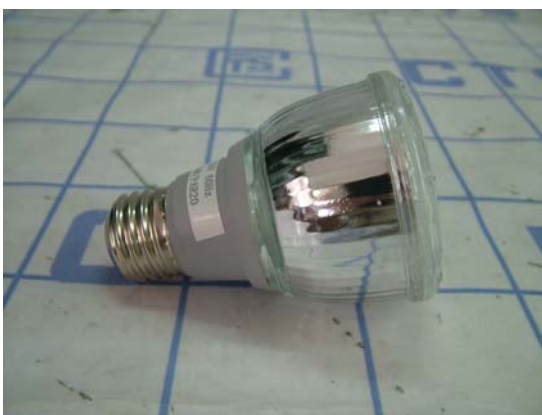
External view left

Copyright of this report is owned by Centre of Testing Service and may not be reproduced other than in full except with the written approval of the issuing Company.