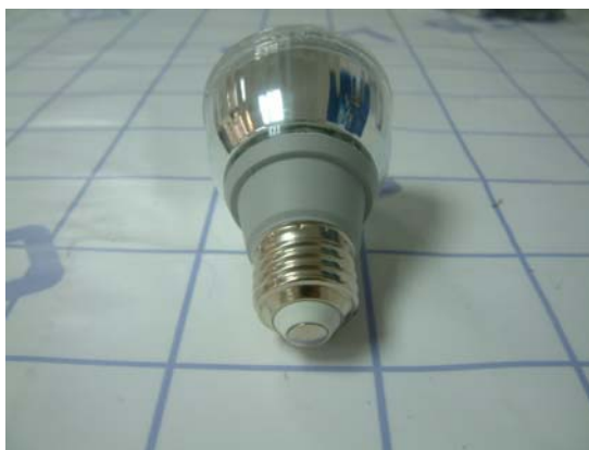
External view back