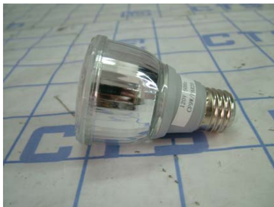
External view right

Copyright of this report is owned by Centre of Testing Service and may not be reproduced other than in full except with the written approval of the issuing Company.