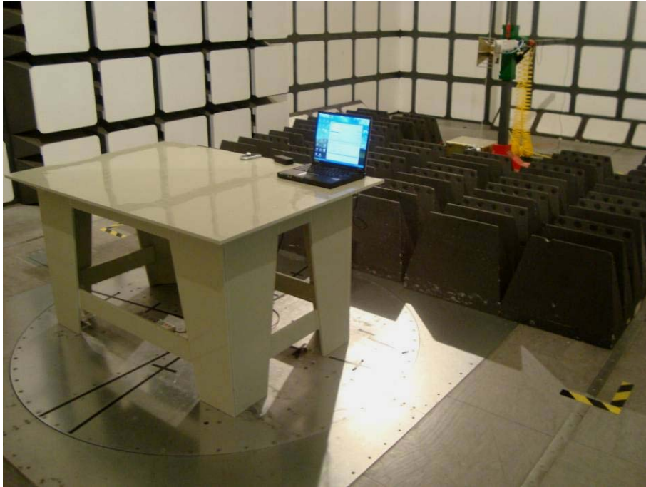
Above 1 GHz: Spurious Radiated Emissions - Rear View (Transimittiing mode)