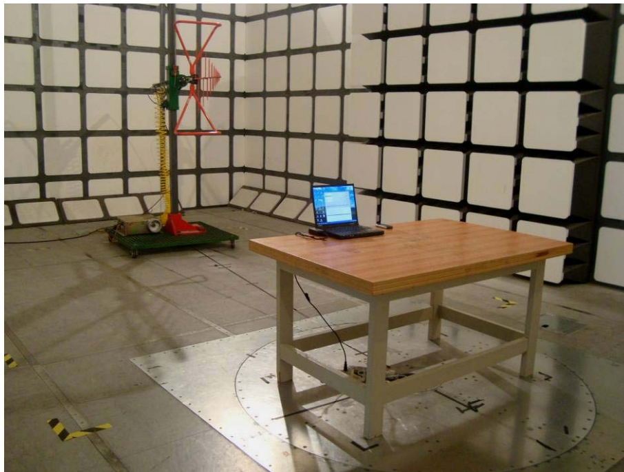
Below 1 GHz: Spurious Radiated Emissions - Rear View (Transimittiing mode)