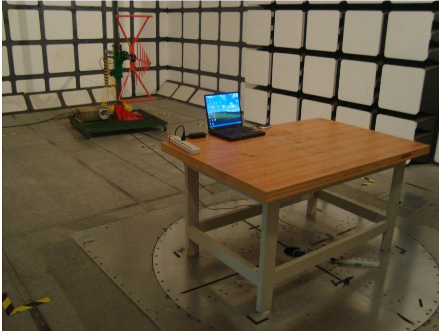
Below 1 GHz: Spurious Radiated Emissions - Rear View (Charging mode)