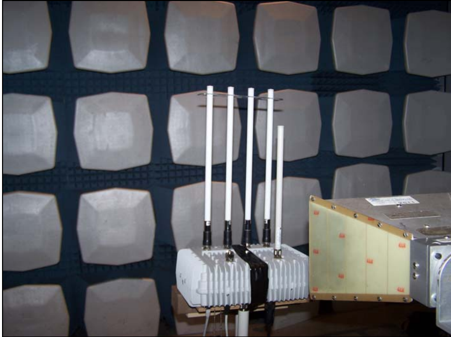
Photograph 1. Radiated Emissions Test Setup