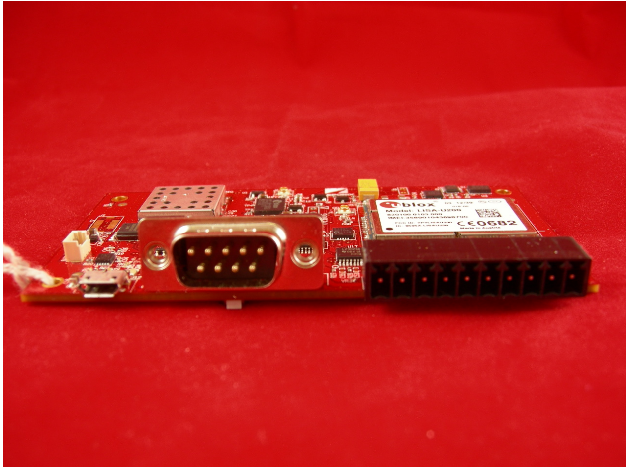
Figure 3: PCB Side